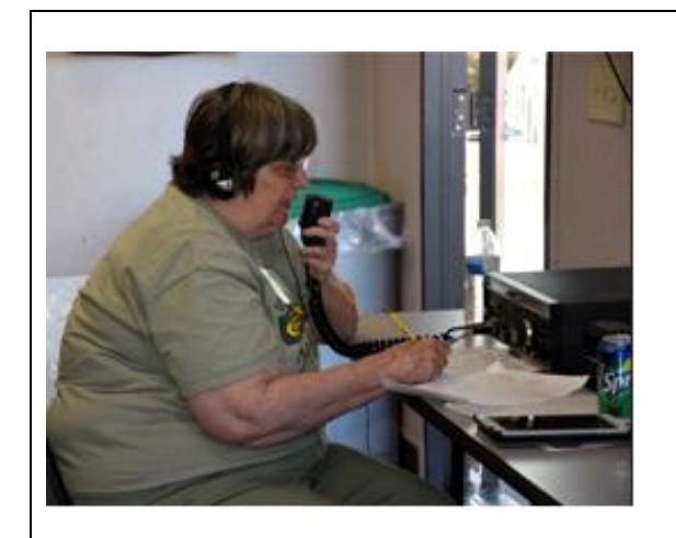
Making contacts on the net using the DRAKE receiver