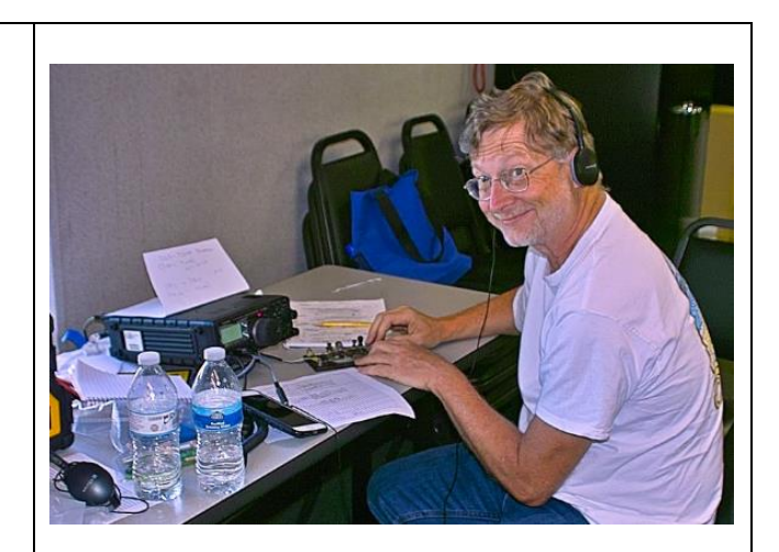
Using CW to make contacts