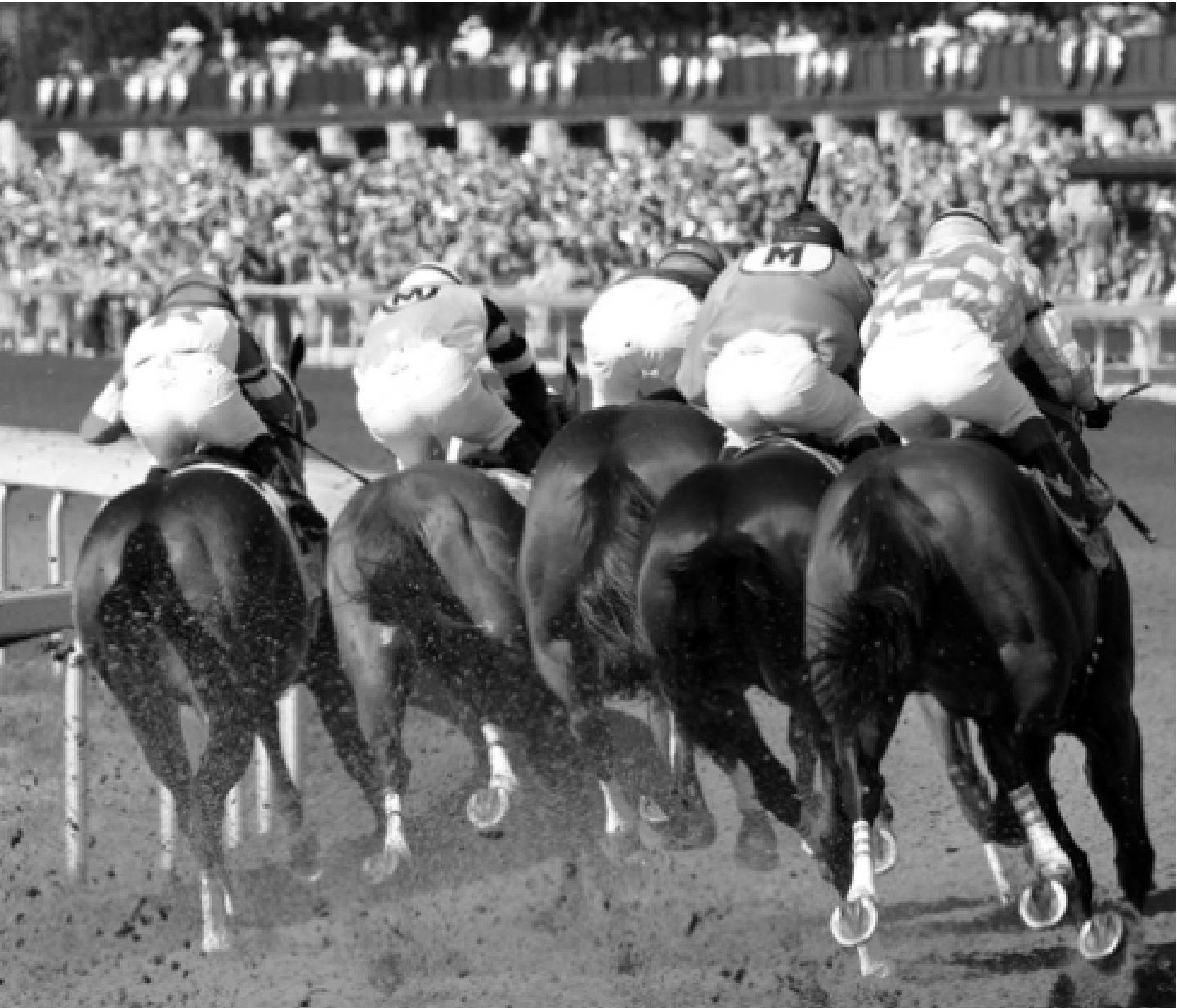
Turning for home at Keeneland. The track has partnered with the Kentucky HBPA and Churchill Downs to generate funds for the Thoroughbred Aftercare Alliance.