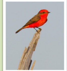
Male Vermillion Flycatcher