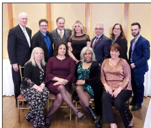
Bronx Advisory Board