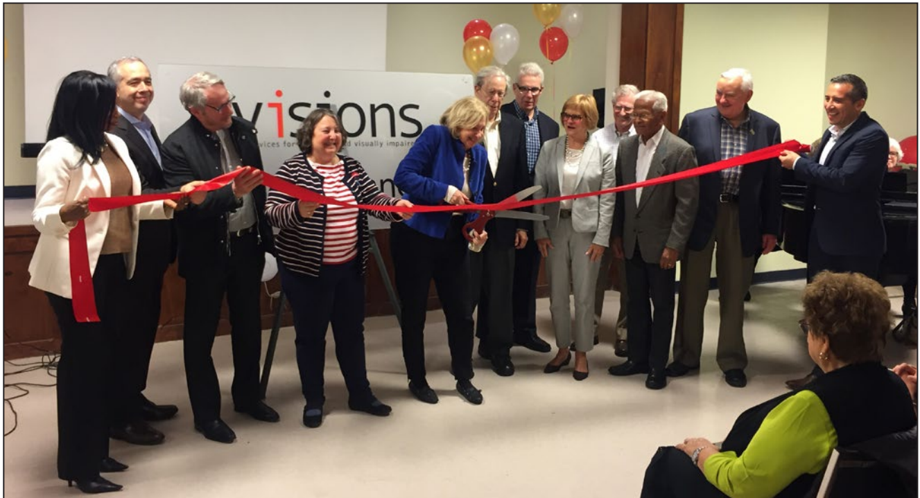
VISIONS Board of Directors and Staff Members cutting a ribbon in celebration of the Grand Re-Opening of VISIONS at Selis Manor