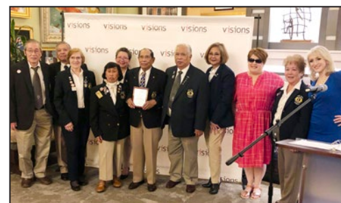
North Star Staten Island Lions