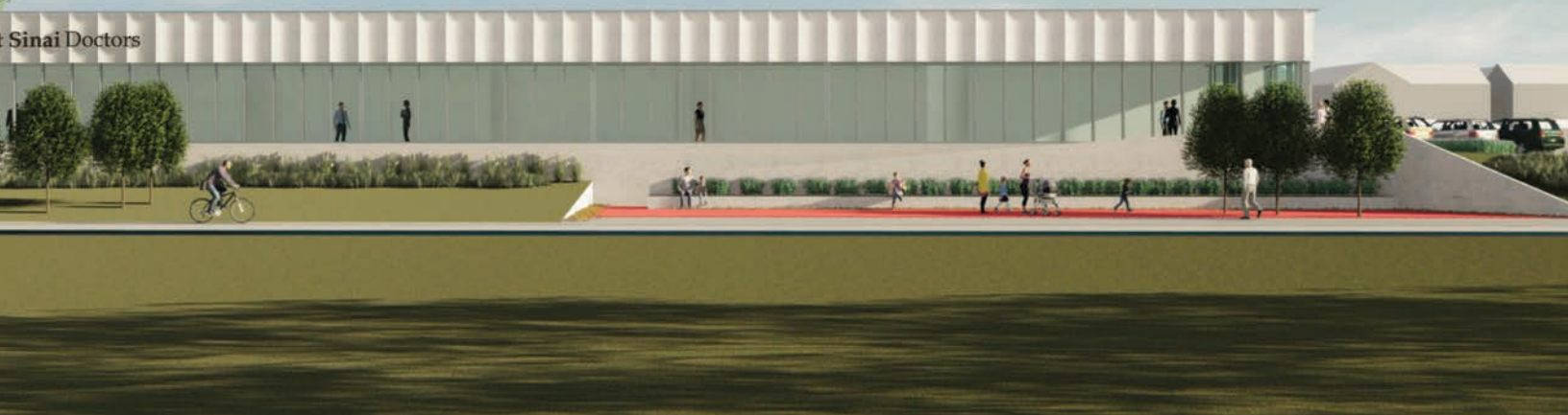
A rendering of the Long Beach Medical Arts Pavilion.