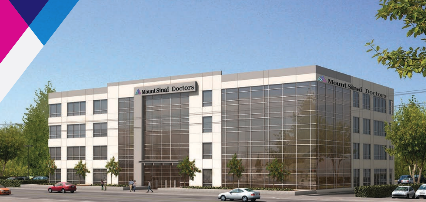
A rendering of the Wantagh multi-specialty medical center.