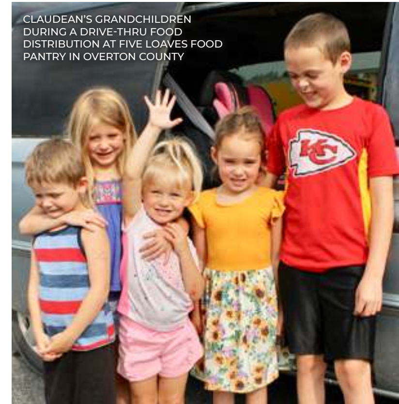
CLAUDEAN'S GRANDCHILDREN DURING A DRIVE-THRU FOOD DISTRIBUTION AT FIVE LOAVES FOOD PANTRY IN OVERTON COUNTY

"When I got sick, I was so afraid it was COVID," she says. "The doctors say it