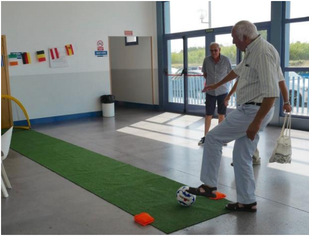
The walking Football Group laid out an area where members could practice their shooting skills. This photograph shows a member trying to score a goal.

The Poetry Group were the second group to entertain the members at the Fayre. With the words on the large screen members were able to follow the poems as they were read.