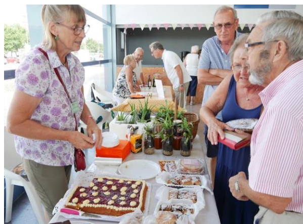
table were members had cakes and donated these to the tea, coffee and wine we 210 euros for the charity.

There was a Cake made some excellent the Fayre. Along with raised a magnificent