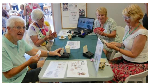
Members had the opportunity to find out more about the Bridge Group, here you can see members of the group playing a demonstration game.