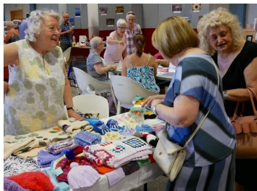
The Knit and Natter Group filled a large table with items they had produced. Half the table included items for sale at very reasonable prices.

With the second half of the table being for items they had made which were for demonstration only.