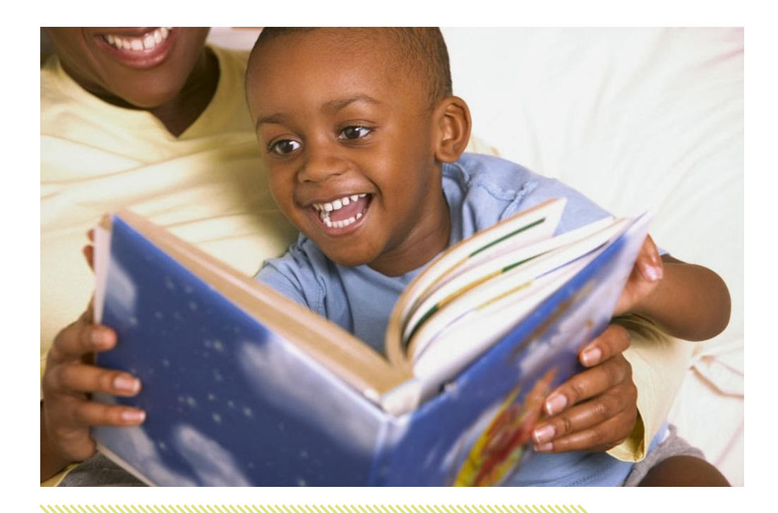
Mission Possible: How-to Set Up Summer Learning for Struggling Readers

Students achieve more when they are able to receive consistent instruction and practice their reading skills daily. Therefore, districts should use the pre-planning period to develop incentives for parental engagement. ROGL evaluators found that getting students "in the door" was the biggest obstacle to pushing students toward grade level proficiency. Thanks to dedicated parents who supported consistent attendance, students who attended at least 50 percent of the program made substantially greater gains in reading achievement compared to children who were invited but did not participate. Districts may have similar challenges but can work to involve parents and encourage positive outcomes from regular student attendance. Strategies for parent engagement are discussed later in Step 8.