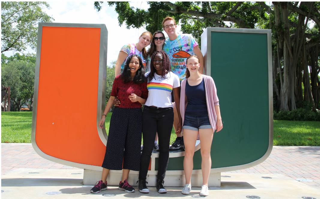
Precollege students at the U statue next to the Rock Plaza on the Coral Gables campus (2019)

Commuter students should plan to spend time on campus in the evening and on weekends to participate in study sessions, campus activities, and weekend excursions. The level of on-campus involvement will shape individual student experiences. Activities outside of the classroom provide commuters with time to bond with a diverse group of students from around the world and form lasting friendships.