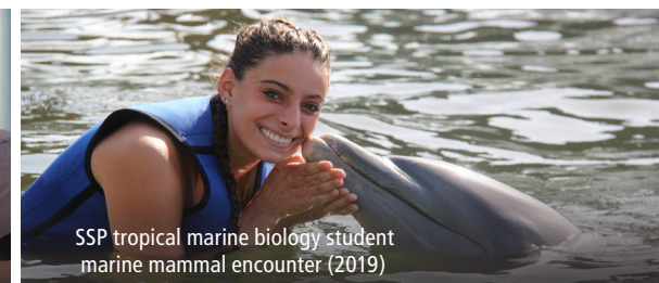
SSP tropical marine biology student marine mammal encounter (2019)