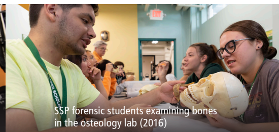
SSP forensic students examining bones in the osteology lab (2016)