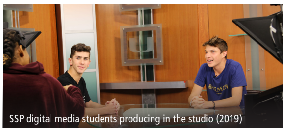
SSP digital media students producing in the studio (2019)