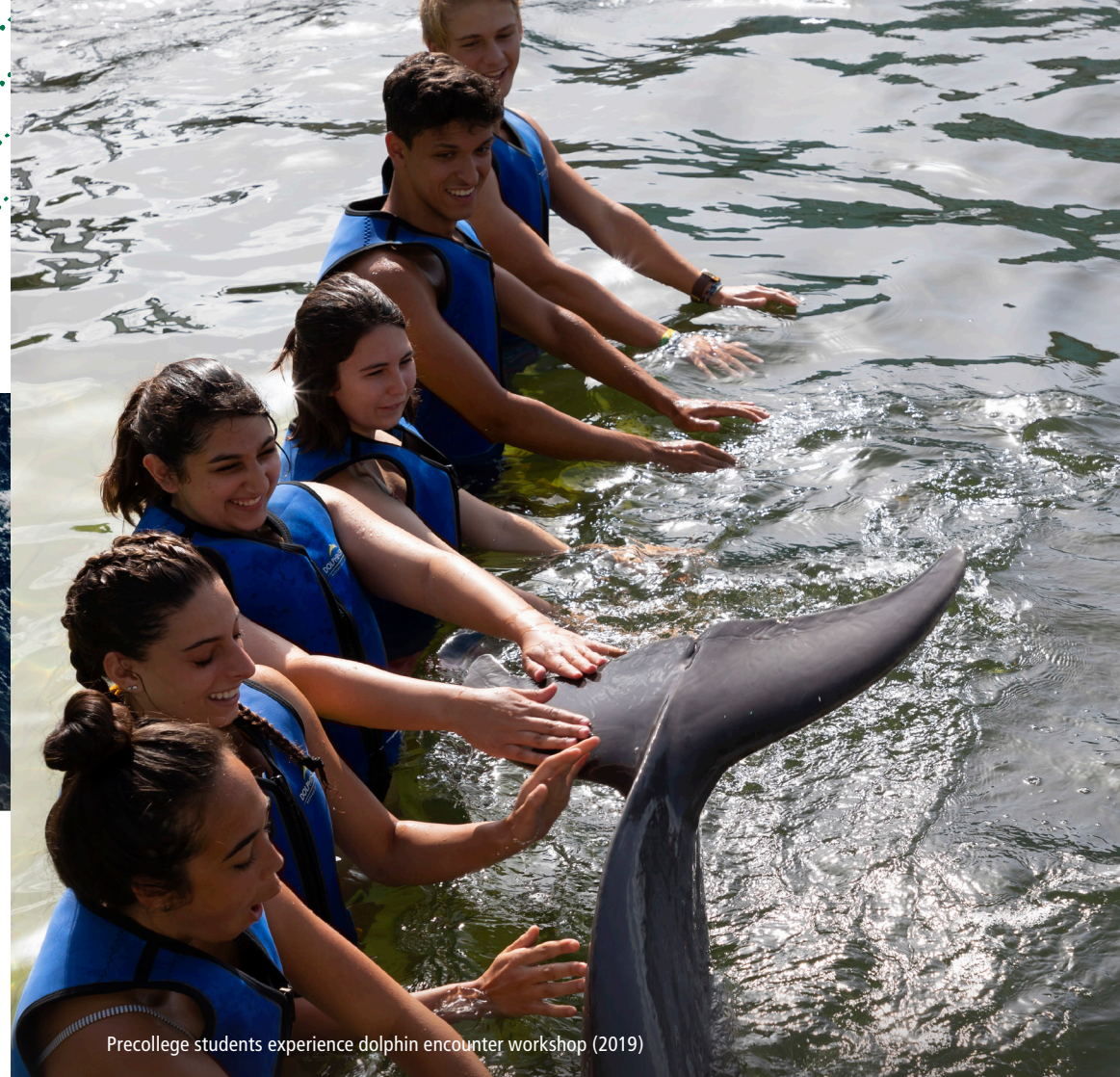
Precollege students experience dolphin encounter workshop (2019)