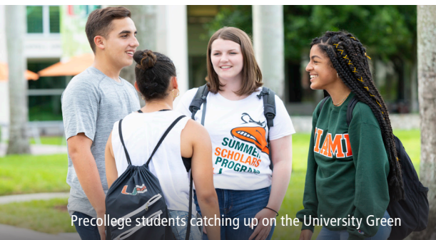
Precollege students catching up on the University Green

COURSES ARE SUBJECT TO CHANGE: For the latest course listings please visit miami.edu/precollege