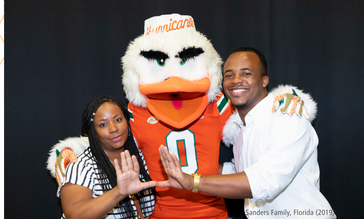
Sanders Family, Florida (2019)