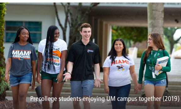
Precollege students enjoying UM campus together (2019)

Students use their free time to work on class assignments, study at the library, swim at the campus pool, exercise at the Wellness Center, explore the campus, and join evening and weekend activities. On weekends, Summer Scholars have the opportunity to explore Miami and South Florida by participating in activities organized and chaperoned by program staff. Weekend activities may include: snorkeling in Key Largo, attending a Miami Marlins baseball game, touring Miami Beach and Wynwood, and earning community service hours. Students may also have an opportunity to participate in a dolphin encounter in Key Largo (additional fee applies).