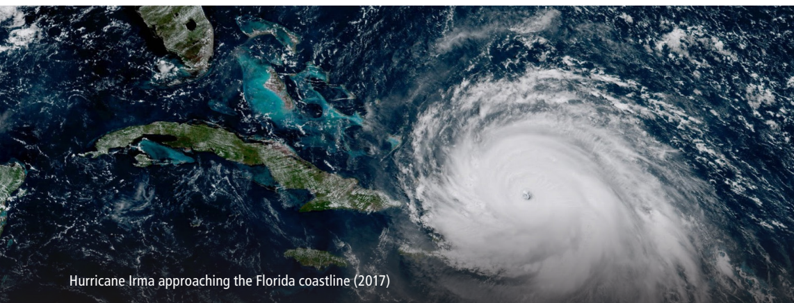
Hurricane Irma approaching the Florida coastline (2017)

For the latest course listings, please visit miami.edu/precollege