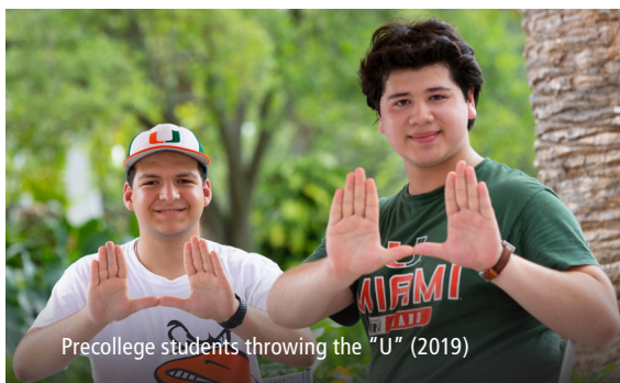
Precollege students throwing the "U" (2019)

"The Summer Scholars Program really gave me a sense of what college is like, in areas that I was interested. I realized that there is big change from high school to college, wherein college you have to do much more on your own. I am thankful I got to experience this now, so when I am ready to attend college I will be prepared for the challenges that come with the courses. I feel that all high school students who have the opportunity to take part in this program definitely should!"