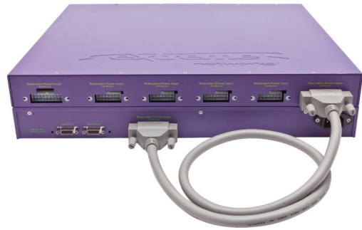
EPS-C2 Connected to a Summit X440