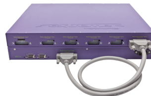
EPS-C2 Connected to a Summit X440