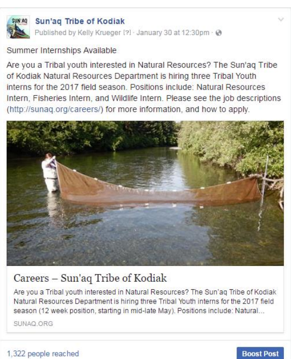
Figure 1. Facebook post advertising Tribal youth internships.

Objective 1 Accomplishments: The award notice for this project arrived in April 2016 and the positions were advertised for three weeks, but no qualified youth applied. Due to the lack of qualified applicants, STK requested a one-year extension for the project. The extension was granted by the BIA Project Officer. From January – April 2017, STK collaborated with project partners to determine the intern schedules to ensure maximum field work time, and determine the safety training schedule. It was determined there would be a Fisheries Intern, who would work primarily with KRAA, a Wildlife Intern, who would work primarily with ADF&G, and a Natural Resources Intern, who would work with all partner organizations. Job descriptions (Appendix A) were distributed beginning January 30, 2017 to the following: project partners, STK Facebook page (Figure 1), STK website, State of Alaska Job Center, Kodiak Rural Leadership Forum, Kodiak Area Native Association, Kodiak Native corporations, statewide distribution lists (What's up and EPA R10