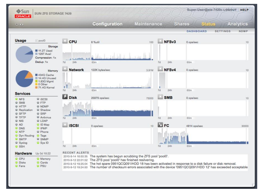
Figure 1. Real-time analytics increase storage optimization and reduce down time.

Provisioning and management are dramatically simplified in the Sun ZFS Storage Appliance through the browser user interface that takes the guesswork out of system installation, configuration, and tuning.