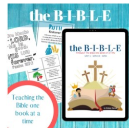
The BIBLE Unit 1: Genesis to Ezra (13 Week Curriculum) from $97 $125