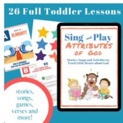
The Ultimate Toddler Bundle: Everything you need to teach age 1-3 about God