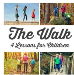
"The Walk" 4 Week Study on Following Jesus $29 $45