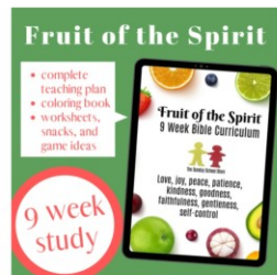
"The Fruit of the Spirit" 9 Unit Curriculum for Kids $57 $90