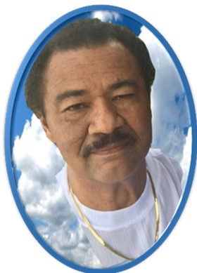
Minister Ronald Spinner