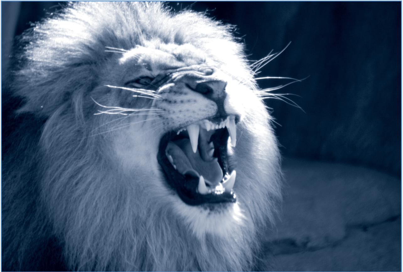
Lion Roaring.