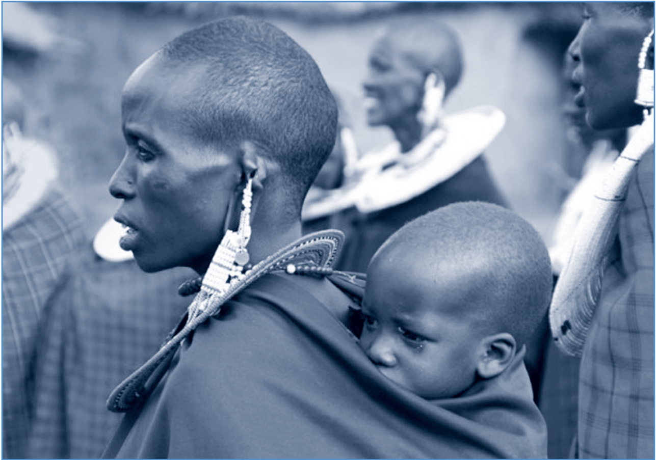
Mother and Child.

and without the lion's beauty or power. The boy could not even walk, but crawled about, beastlike, a pathetic thing. And the king wondered, how can it be that this is the son foretold by the prophecy? And his heart was heavy.