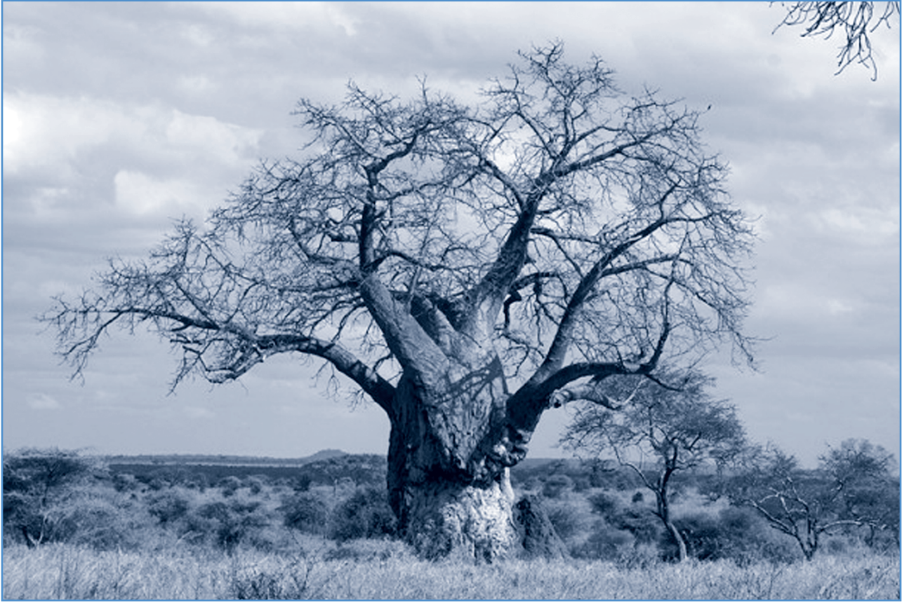
Baobab tree.