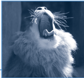
Lion Roaring.

and thus the empire of Mali came to be, and peace was known throughout the empire for over two hundred years, for as skilled as he was as a warrior, Sundiata was even more skilled in the arts of peace, and he created a great administrative center, and he taught the people to grow new crops, such as beans, rice, and cotton, and to establish trade routes throughout the empire, so that no one would have to want, and for these accomplishments he is remembered: great Sundiata, the Lion King, the liberator who forged an empire and brought peace and prosperity to the people.