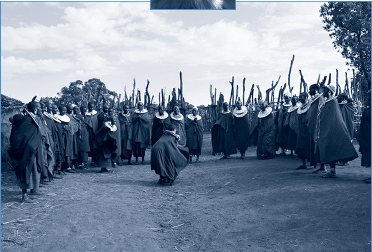
Celebratory Dance.