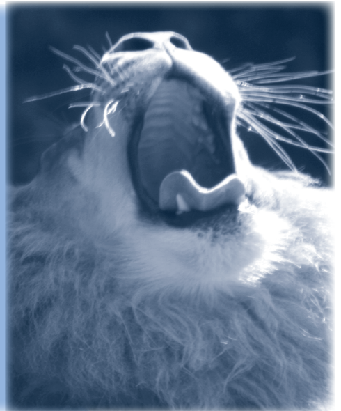
Lion Roaring.

Like the other great oral epics from the world's literatures, the Sundiata has no single author. Instead, it had generations of authors who composed the work orally and then passed it down to other singers, or griots. Becoming a griot was (and still is) a rigorous, daunting undertaking, involving mastering traditional stories and verse forms, memorizing great bodies of traditional material, and becoming an accomplished musician and performer. The Sundiata became known to the Western world when it was first collected from traditional storytellers in the early twentieth century.