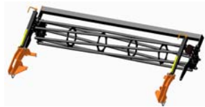
Cage Roller pictured with mechanical leveling adjustment & optional leveling bar assembly