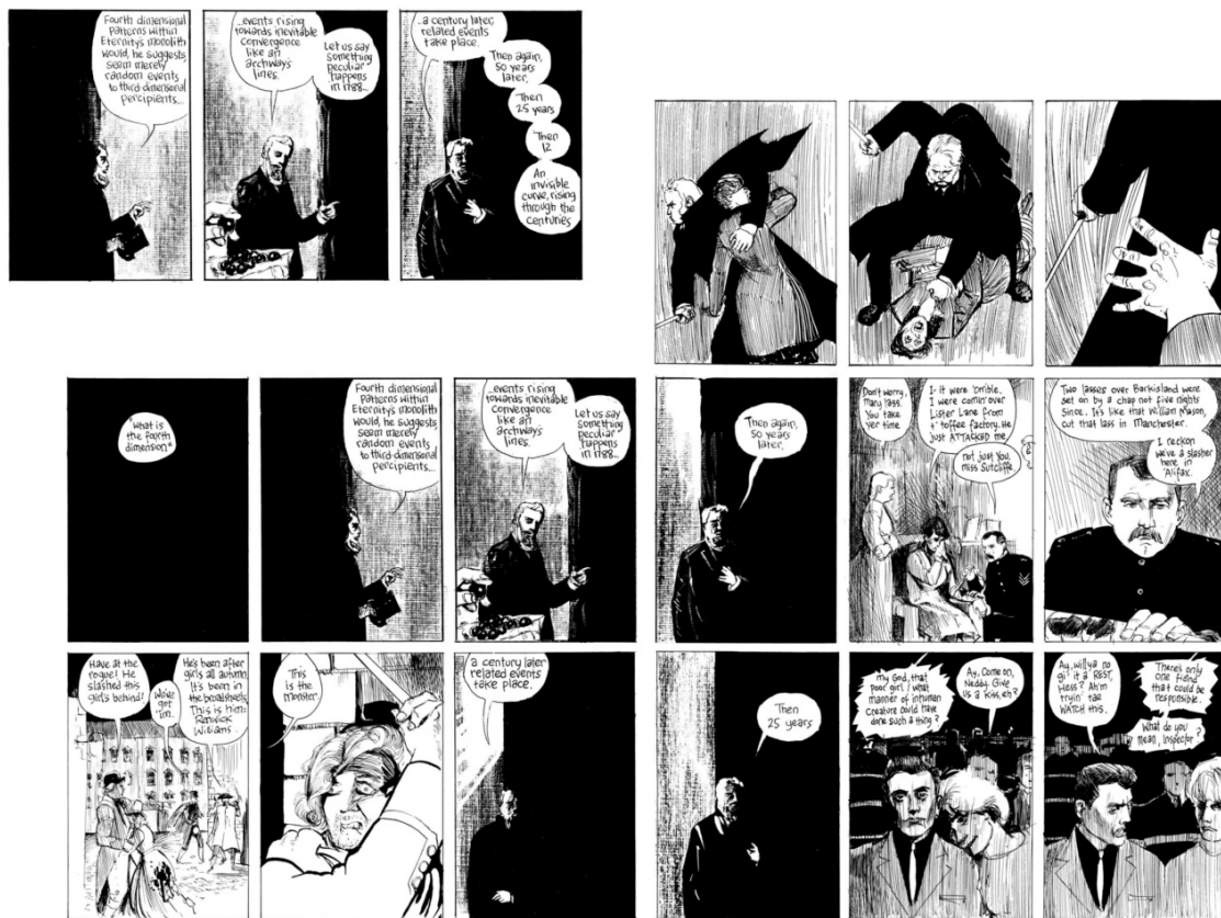
Figure 6: From Hell 2:15/1–6 (top left), 14:12/4–9 (bottom left), and 14:13 (right).

title of Charles H. Hinton’s article published in 1880 – are both repeated three times (in FH 14:14/5, 14:17/2, and 14:19/7, and in FH 14:4/9, 14:12/4, and 14:18/5, respectively). The repetition highlights the importance of the statements. The repeated panels are the portal into the fourth dimension for Gull, as they are for Dr. Manhattan. Moreover, the narrative strategy of panel repetition is at the core of the “speculativeness” of both of these fictions. The extraordinary powers of Dr. Manhattan and Sir William Gull are the strongest speculative elements in the graphic novels – otherwise they would simply be tales of disturbed people in masks and a madman killing prostitutes in Victorian London with alternate historical storylines.