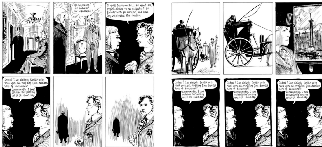
Figure 1: From Hell 9:12/1–6 (left) & 12:4/1–6 (right).

Repeating the same panel several times is an interesting technique available to comics, and it can be used rather obtrusively, as this example demonstrates. Alan Moore makes use of panel repetition in several of his works, having the past intrude into the present narrative in the form of panels that have already been shown. Often, only the image is repeated: the contents of the visual track recur but the textual track is altered. In other cases, such as this, the whole panel is repeated with the textual track intact. One can make the case that there are subtle differences between these uses and that the complete repetition of a panel draws more attention to the panel's materiality, emphasizing its status as a copy of an original. On the other hand, even panels with altered textual tracks – for example, the removal of word balloons and the insertion of captions with “voice-over” narration – are easily recognizable due to the immediate way we view images, as opposed to the way we read text. Whereas text has to be read one word at a time in a linear fashion, we perceive the image in front of us as a whole, to some extent. Different works also establish differing stylistic conventions for repetition. 4