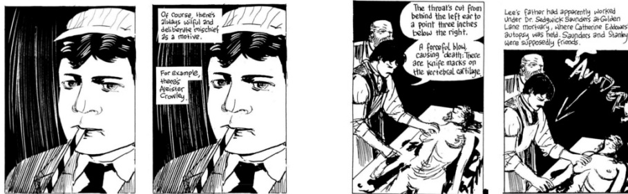
Figure 7: From Hell 9:4/5 and Appendix 2:3/5 (left). From Hell 9:5/5 and Appendix 2:5/5 (right).

In a number of other repeated panels, even the original textual track is left intact but partly covered by captions belonging to the voice-over narration of the appendix. When discussing the theory of Thomas Stowell put forth in 1970 – the first one to connect the murders to the royal family – the comic repeats the panel in which detective Abberline and Robert Lees enter Gull’s house in From Hell chapter 12 (figure 8, left). The original textual matter is visible but new captions have been placed over it, reminding the reader of two things. First, that the details discussed – the statements of Gull’s daughter about police and a psychic visiting the house – are familiar and they have been shown during the course of the narrative. Second, that the panel in question is a comics panel and it has been shown during the course of a comics narrative.