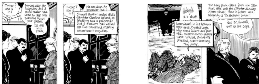
Figure 8: From Hell 12:10/1 and Appendix 2:11/5 (left). From Hell Appendix 2:12/2–3 (right).

The same kind of panel repetition technique is used when the appendix explores other sources of similar conspiracy theories. In a journal interview in 1970, Cynthia Legh claimed that Robert Lees told her an account of the murders resembling the one which is depicted in From Hell , whereas Chicago Sunday Times-Herald had run a similar story already in 1895. When these are discussed on page 12 of the appendix, two panels are repeated (figure 8, right): one showing Robert Lees having a fake seizure (Prologue:4/6) and another one depicting the secret meeting in which the leading Freemasons decided to fake Gull’s funeral and shut him in an asylum (FH 12:21.6). In the latter panel, the partially visible speech balloon includes the name Dr. Howard who was named as a source in the Chicago Sunday Times-Herald article.