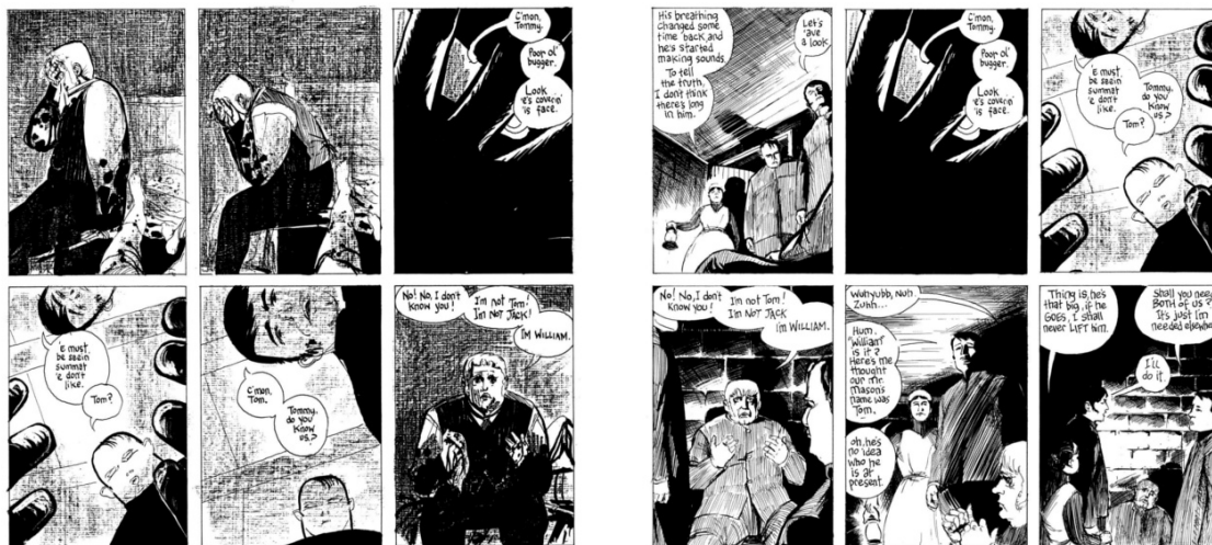
Figure 4: From Hell 10:25/1–6 (left) & 14:2/1–6 (right).

The first time a repeated panel is connected with Gull's supernatural visions occurs in the beginning of the chapter. On page 2, there are three panels that are drawn from his point of view (FH 14:2/1–3, the top row of panels on the right in figure 4). Two of them have been previously presented in chapter 10 after Gull killed his last victim and had a series of disconcerting hallucinations discussed above. Frightened by his visions, Gull sits on the bed next to the dead body and experiences a temporal shift: unknown men look down on him and call him “Tom” (10:25.3–4, the panel sequence of the left in figure 4) – that is the fake identity which will be used when he is later locked up in the asylum.