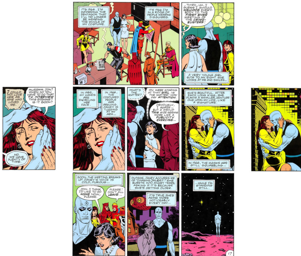
Figure 3: Watchmen 3:4/1 (left), 4:17 (center), and 4:18/5 (right).

From the point of view of the narrative order, these temporal disjunctions are anachronies, more specifically prolepses (Genette 40), which present something that has not yet taken place – that is, if the scene is considered to belong to the temporal level of the Crimebusters meeting. On the other hand, if we examine the relations of these panels to the time of Dr. Manhattan standing on Mars on panel 8, they are (more recent) flashbacks interrupting another flashback, or, by Genette’s terminology, analepses. Dr. Manhattan’s total perception of time challenges these straightforward concepts of flashback and foreshadowing.