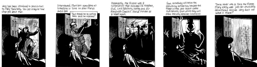
Figure 9: From Hell Appendix 2: 6/4, 18/7, 19/7, 22/9, and 23/9.