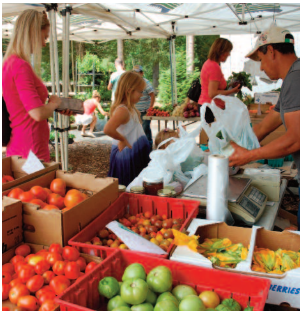
Visitors enjoyed supporting local businesses at our Sunday Farm Market this summer.

Our SM&NC Sunday Farm Market kicked off another successful year, with great new vendors and returning favorites. The Heckscher Farm stand sold our own eggs, wool, and syrup, as well as items like meat and milk, in partnership with other local farms. Our market-based Edible Science series bridged food and science, as participants discovered secrets of their favorite foods, such as elasticity of dough, while exploring where our food comes from.