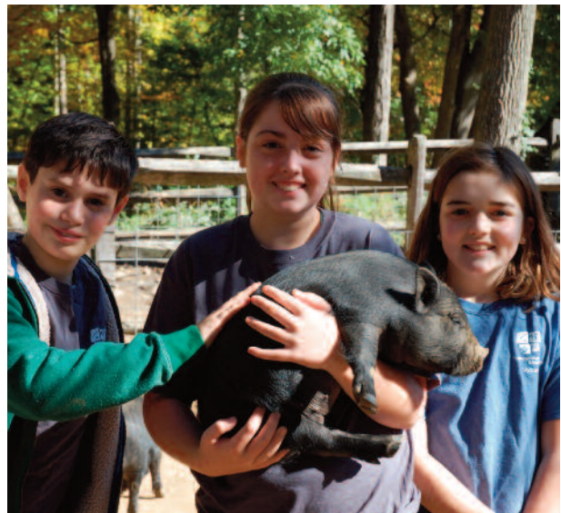
Our Junior Curators program gives children the opportunity to learn about service, animal care, and farm life.