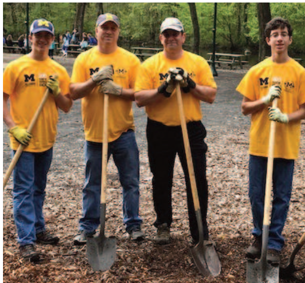
Volunteers from the University of Michigan Alumni Association.

We thank all the corporate groups, school groups, families and individuals who offer their help throughout the year. It's because of you that our festivals, programs, special events, and overall mission continue to thrive.