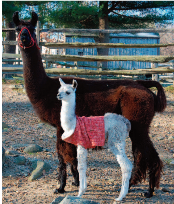
Meg, the first alpaca cria born on the farm in 13 years, with mother Rosie.

The farm welcomed 16 chicks, 8 ducklings, 17 kids, 16 lambs, and Meg, the first alpaca cria born on the farm in 13 years. We also saw the first year of Heckscher Farmers, a program designed to give summer campers in grades 1-4, a small-group, hands-on experience in farming. The program was met with resounding success with a 100% enrollment with wait list.