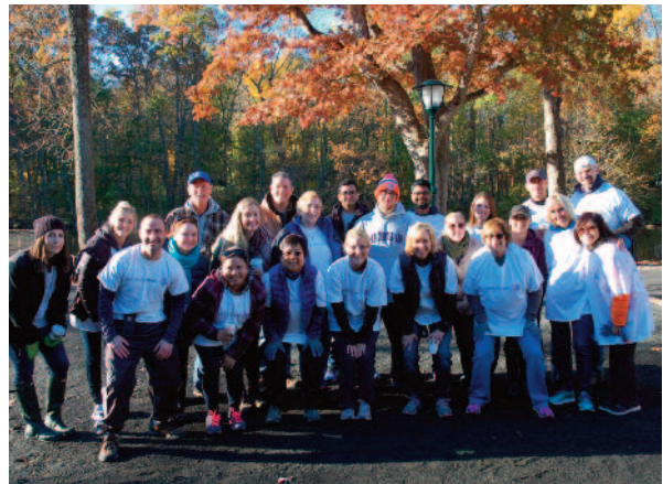
Volunteers from Pitney Bowes, Inc.

The SM&NC was fortunate to have the support of local corporations such as Ernst & Young, Frontier Communications, Indeed, JP Morgan Chase, Legg Mason, Pitney Bowes, RSM US, and State Street Global Advisors. These generous corporate partners not only supplied almost 500 hours of volunteer service, but in many cases also provided funds to purchase the necessary materials. These groups