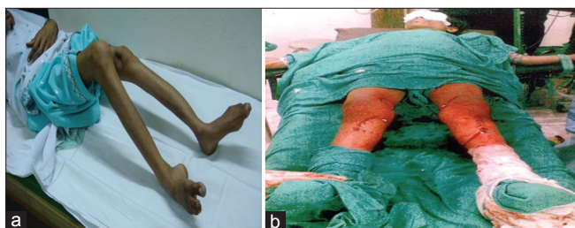
Figure 7: (a and b) Mixed deformities flexion contracture, genu valgum and rotational deformity pre and post-operatively