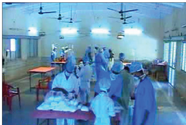
Figure 1: Operation theater prepared at the site of camp