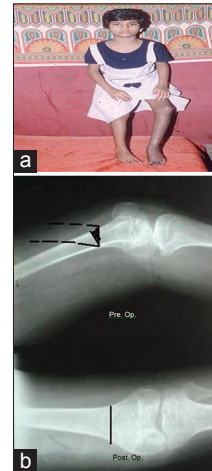
Figure 3: (a and b) Radio graphical evaluation of the patient pre and post-operatively in buttonhole anterior wedge osteotomy in case of flexion contracture deformity

The approach is the lateral side of the lower third of thigh and indication is for rigid knee flexion deformities without any soft tissue contracture and with hand on knee gait with quadriparesis.