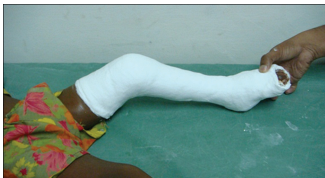
Figure 6: Plaster cast after posterior wedge osteotomy for genu recurvatum