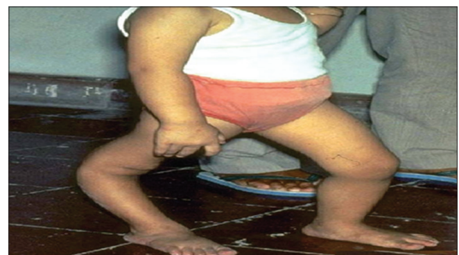
Figure 5: Case of genu recurvatum