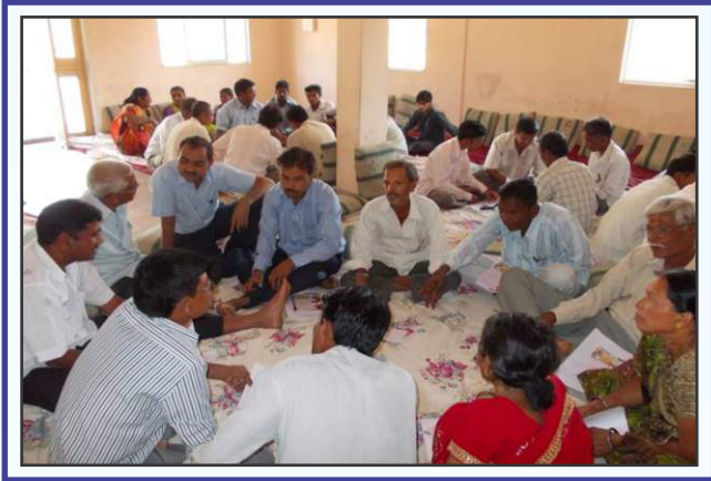
VMS PROGRAMME MIYAPUR (MAHUVA)