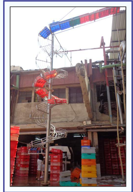
POUCH CRATE SLIDER SYSTEM