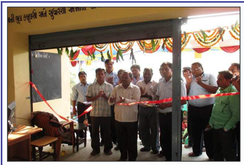
"INAUGURATION OF BCU" CHORAMBA DUDH UTPADAK COOPERATIVE SOCIETY LTD.