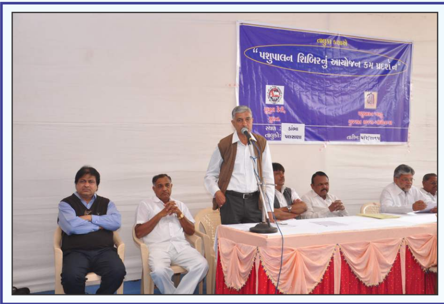
"VETERINARY CAMP" DAMBHA (PALSANA)