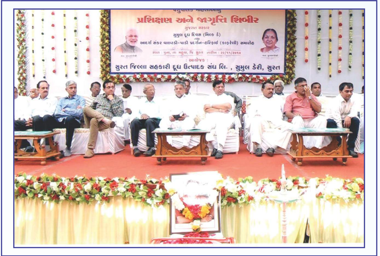
"SUMUL MILK DAY" ON THE OCCASION OF THE "NATIONAL MILK DAY CELEBRATION HONOURABLE SHRI CHHATRASINH MORI STATE MINISTER POONA (MAHUVA)