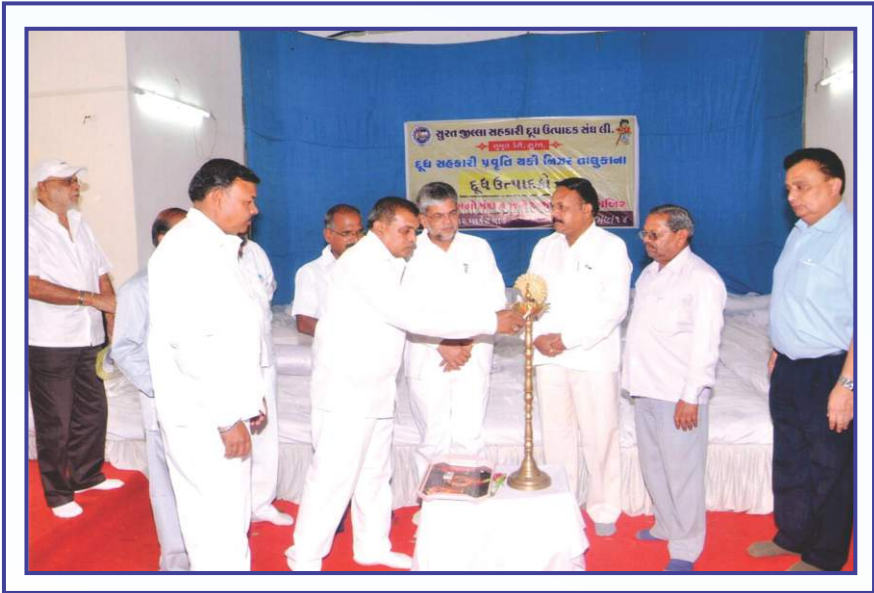
PROGRESS, MENTALCONFLICT & IMPLEMENTATION CAMP NIZAR TALUKA