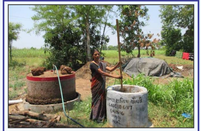
BIO GAS PLANT UMARKACHCHA (VYARA)