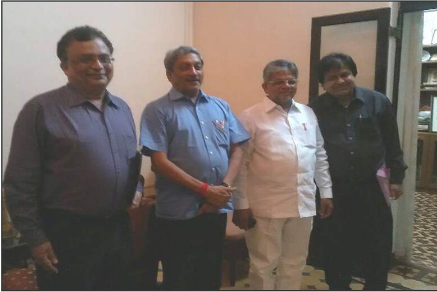
Visit to present defense Minister of Indian Government Respected Shri Manohar Parikar at Goa