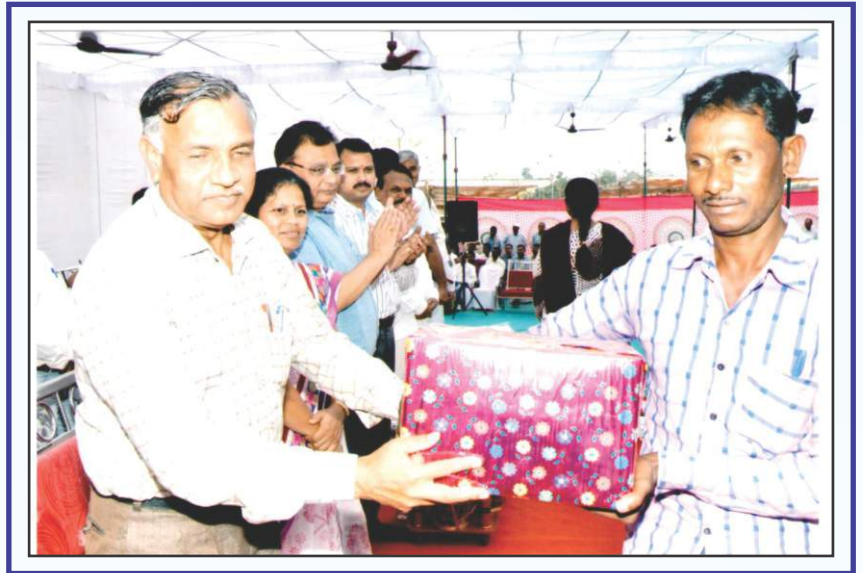
CALF RALLY AT MALANGDEV (SONGHDH)