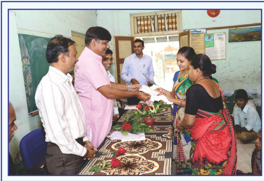
CHEQUE FOR EQUIPMENT ASSISTANCE