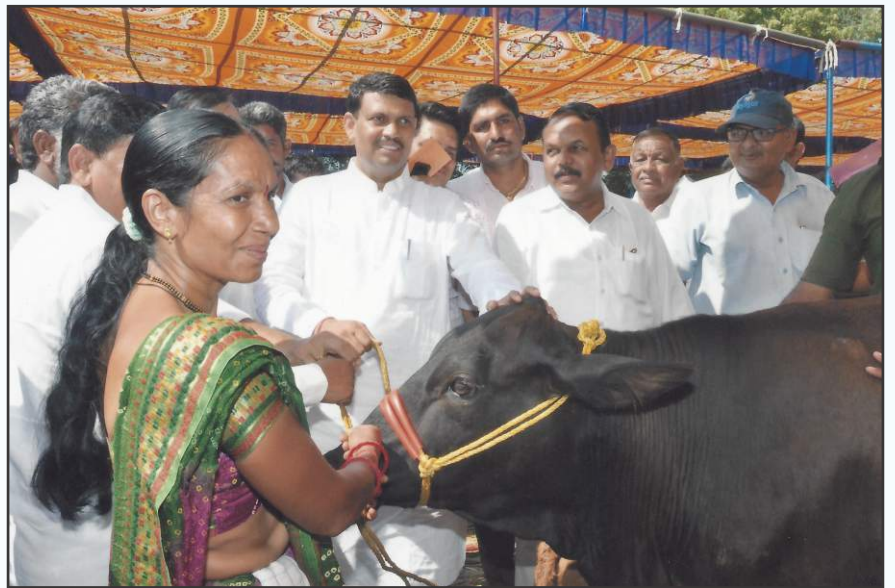
IN" IDDP UNDER VANBADHU KALYAN YOJNA" "DISTRIBUTION OF MILCH ANIMAL UNIT & KIT" AT BHIMPORE (VALOD)