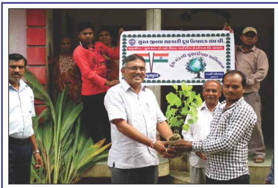
"TREE PLANTATION AT SOCIETY LEVEL" AMBACH (VALOD)