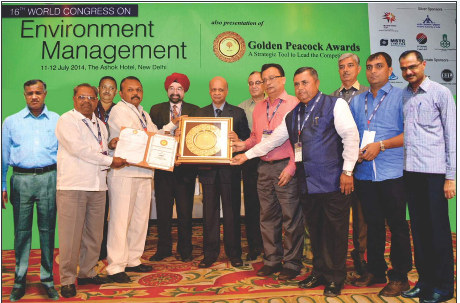
SUMUL HAS RECEIVED HONOUR ACQUIRED "GOLDEN PEACOCK AWARD"