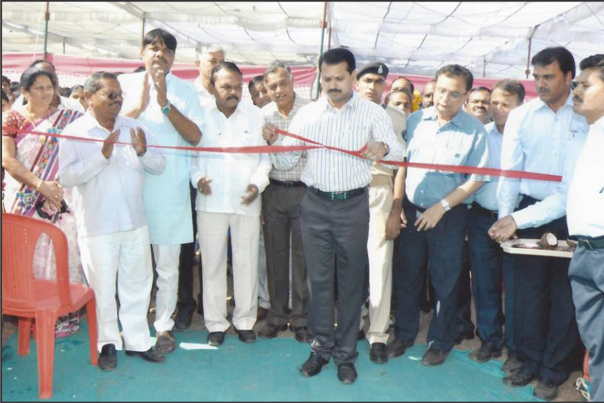
"INAUGURATION OF BCU, MILK HOUSE CUM GODOWN" & IDEAL BUFFLOCALF COMPETITION" MALANGDEV (SONGADH)