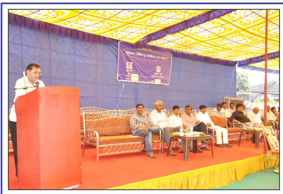
"VETERINARY CAMP" VANKAL (MANGROL)