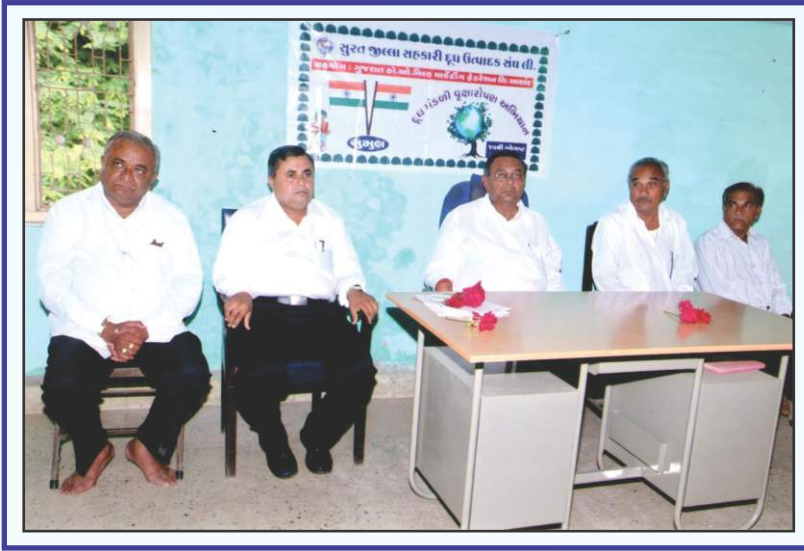
" TREE PLANTATION AT SOCIETY LEVEL" AMBACH (VALOD)