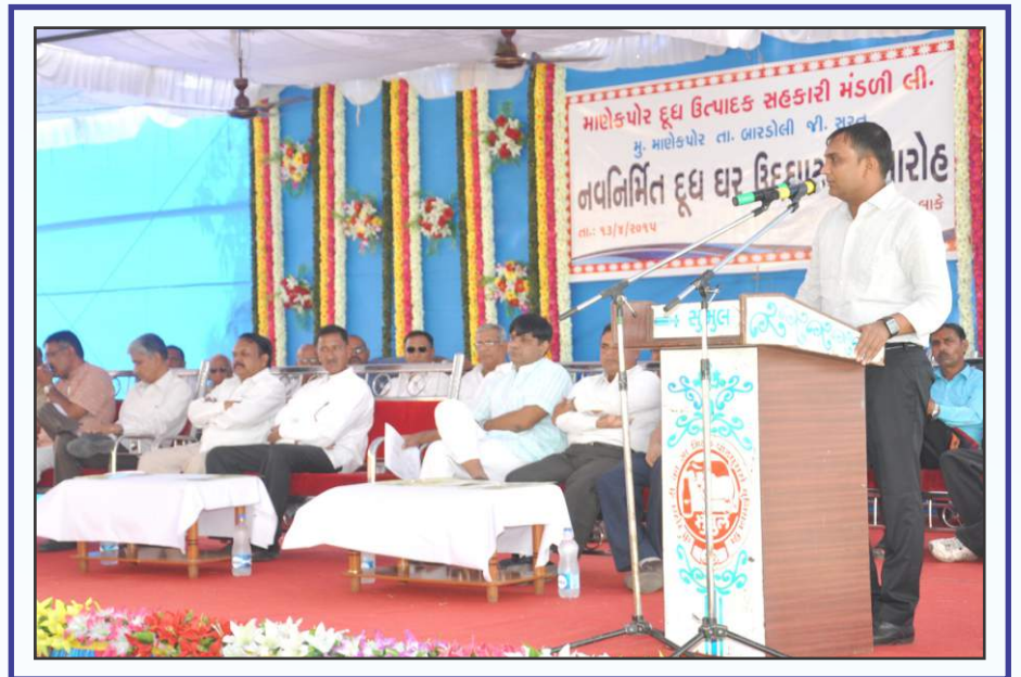
"NEWLY CONSTRUCTED MILK HOUSE FUNCTION" MANEKPORE (BARDOLI)