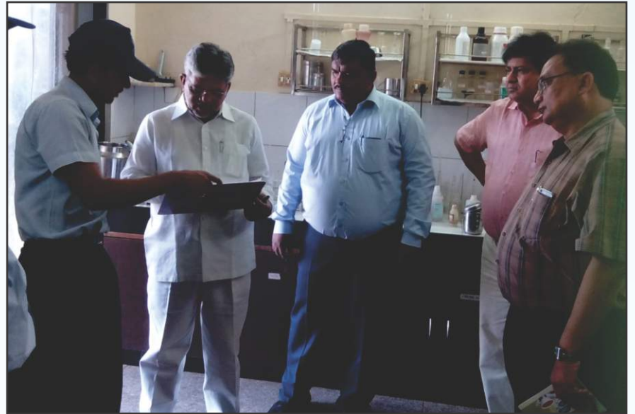
Dairy Conference- Kolkata