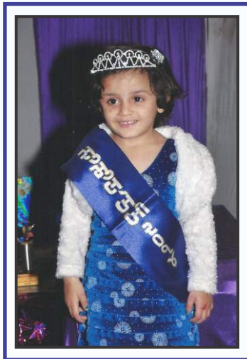
BABY OF THE YEAR 2014 - SURAT