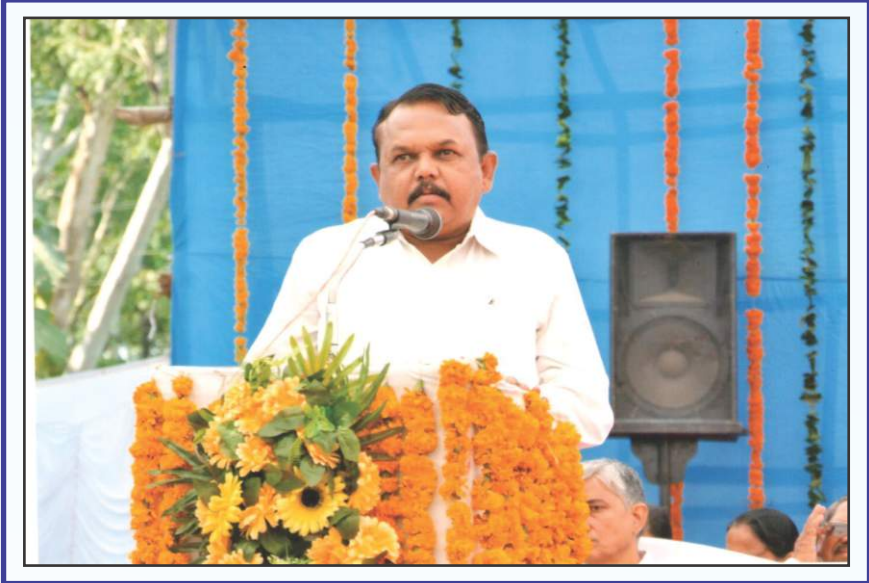
"VAN BANDHU KALYAN YOJANA UNDER IDDP" CATTLE FAIR AT VANKAL (MANGROL)