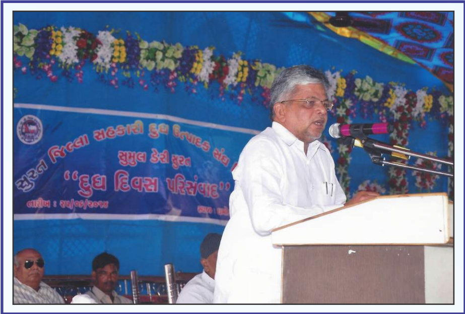
"MILK DAY DEBATE" AT DHAMODI (SONGADH)