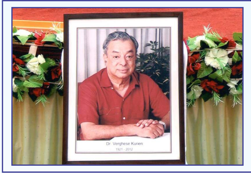
DR. VERGHESE KURIEN (1921 - 2012)