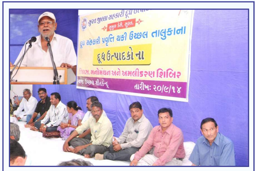
PROGRESS, MENTALCONFLICT & IMPLEMENTATION CAMP UCHCHHAL TALUKA