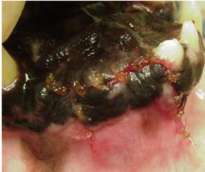
Figure 6 The mucoperiosteal flap is closed with a simple interrupted pattern using 4-0 Monocryl®.