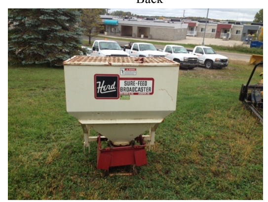
#30 Herd Fertilizer Spreader PTO/3 pt. hitch Winning Bid $258