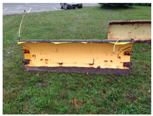
#37 Meyers 7'6" Snow Plow Blade Winning Bid $122.00