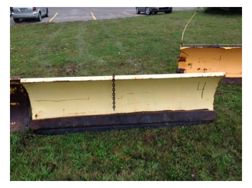
#36 Meyers 7'6" Snow Plow Blade Winning Bid $150.00