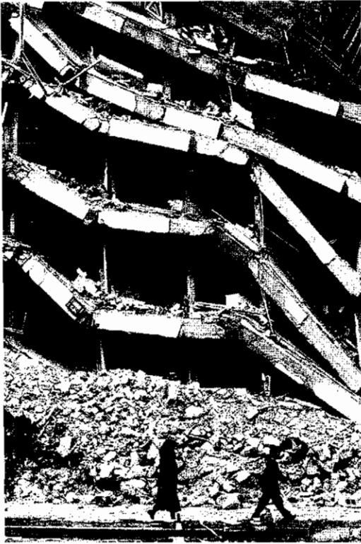
Figure 15 Collapsed Reinforced concrete building in Gölcük

which we can learn valuable lessons for construction today, then these historical structures take on a meaning that brings them to life in ways that transcend their contribution to style. People have coped with the larger than life forces of earthquakes and other natural disasters long before the invention of strong construction methods in reinforced concrete and steel—and as seen from some of these examples here—they sometimes have been remarkably effective.