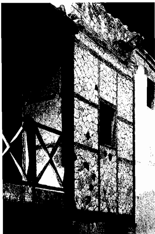
Figure 3 Pre-79AD Infill-frame construction found and restored at Herculaneum