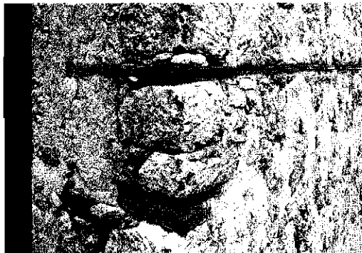
Figure 10 Laced bearing wall in Safranbolu, Turkey

and Adapazari, the earthquake destroyed more than a third of all housing units, almost all of them in reinforced concrete buildings. 6 There were clusters of humi buildings in the heart of these districts. These houses, mostly dating from the early part of the twentieth century, pre-dated the ruined reinforced-concrete apartment blocks nearby. Many of the older humi houses remained intact, but a few were heavily damaged. This finding was confirmed by two Turkish professors who conducted a detailed statistical study in several areas of the damage district who found a wide difference in the percentage of modern reinforced concrete buildings that collapsed, compared to those of traditional construction (Gülhan and Güney 2000). 7