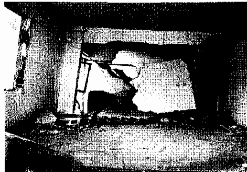
Figure 14 Collapsed interior infill wall in reinforced concrete building in Gölcük

Rarely is the infill considered in the engineering design process as part of the lateral resisting system, and it is often ignored in calculations. In spite of this, the masonry infill does play a significant role that sometimes can help to save a building that has weakened joints. More often, however, it can contribute to the collapse of a building because its rapid degradation in specific areas can transfer concentrated loads onto localized parts of the frame, which are then overwhelmed. As can be seen in Figure 14, these infill walls can readily collapse completely when an earthquake distorts the building's frame. Sometimes, to avoid damage to the surrounding reinforced concrete frame from the «diagonal strut» effect, where the stiff infill causes a corner column to break, leading to collapse, the infill material is sometimes deliberately separated from the frame.