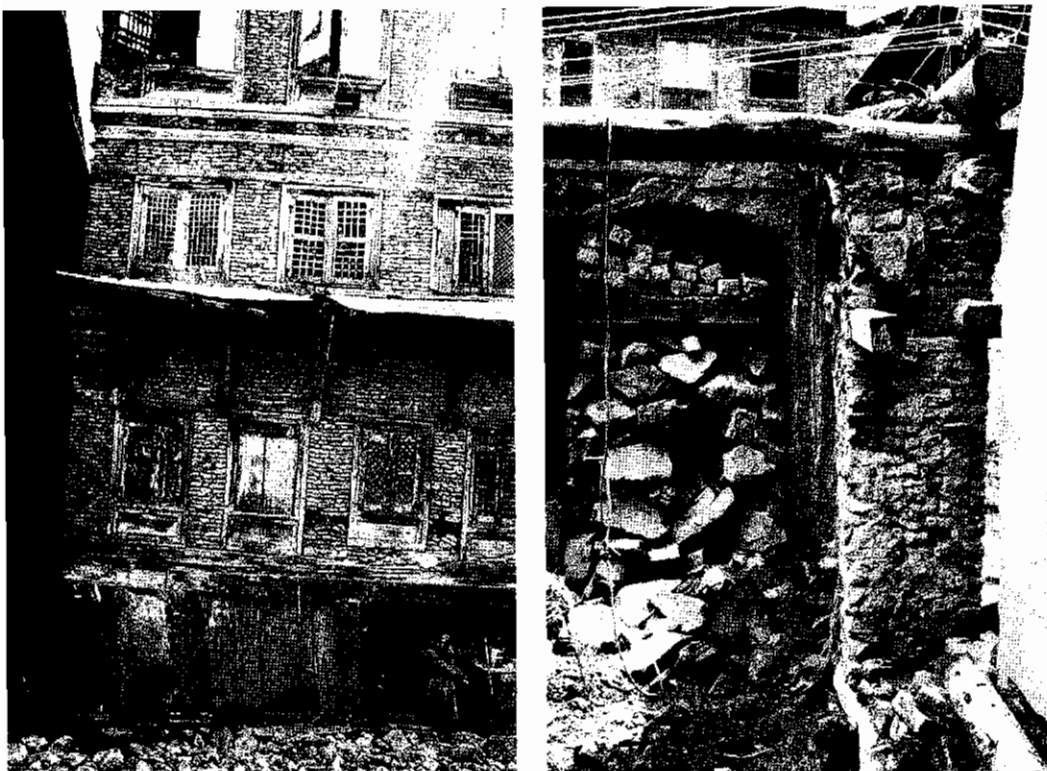
Figures 7 and 8

Taq construction in Srinagar, Kashmir and demolished section of wall showing timber lacing in wall section