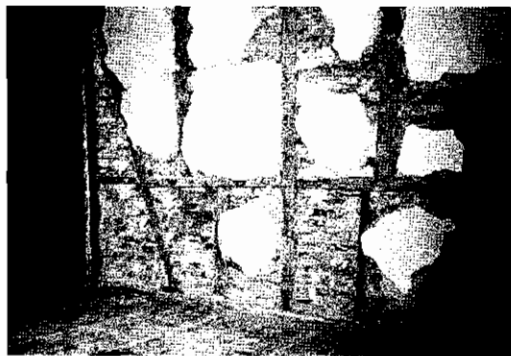
Figure 12 Humu interior wall in Düzce after earthquake

unless the house was stuccoed, damage was impossible to see. The bricks themselves were only infrequently displaced sufficiently for a crack to be visible. The movement was primarily along the interface between the timbers and the brick panels rather than forming a crack within the panels themselves.