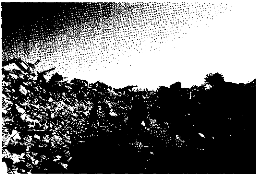
Figure 1 View of Anjar City Center after the Bhuj Earthquake of January 26, 2001

The Bhuj Earthquake devastated older masonry buildings and newer reinforced concrete buildings