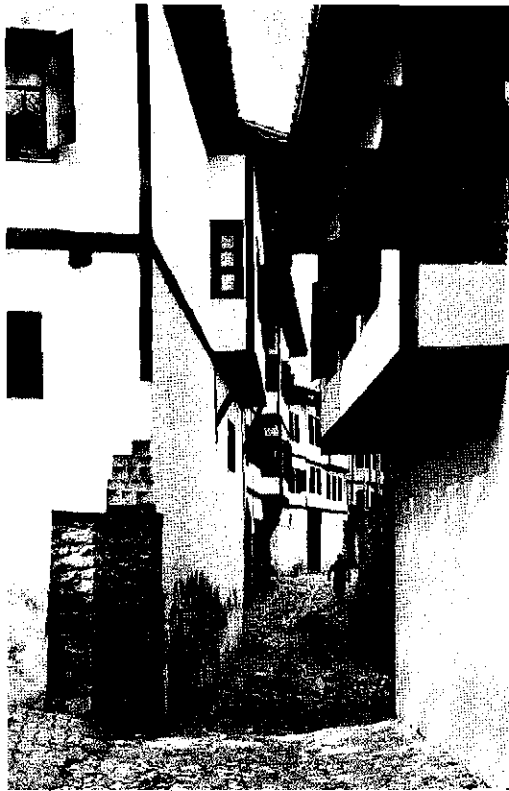
Figure 9 Traditional Ottoman style Turkish architecture in Safranbolu, Turkey