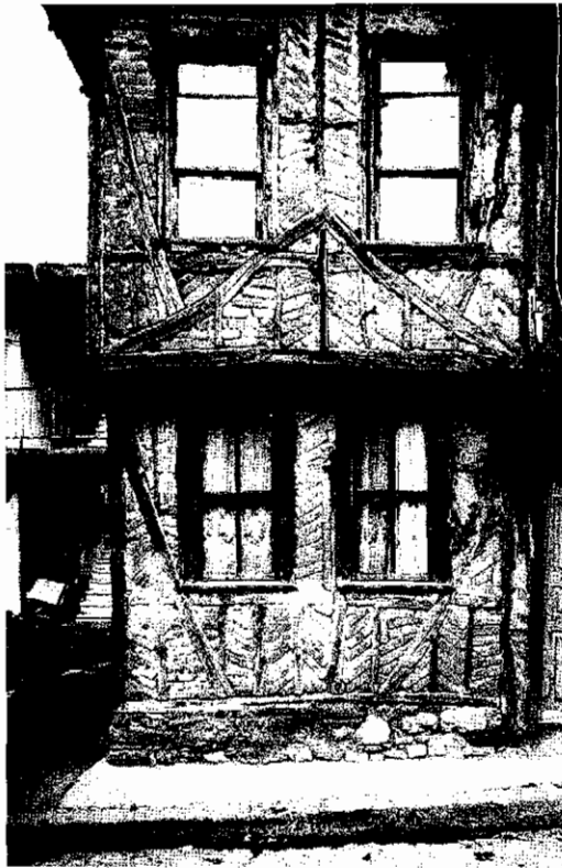
Figure 11 Humu house in Gölcük after earthquake constructed in 1955. There was only slight damage to the interior of this house