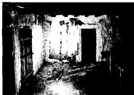
Figure 13 Interior of humi house in Orta after earthquake showing damage to mud and lime plaster over infill walls

Ironically, it was a much smaller earthquake that followed the 1999 earthquakes in Turkey that has provided one of the best sources of data from which to evaluate the capacity for earthquake resistance of the construction, compared to that of the standard