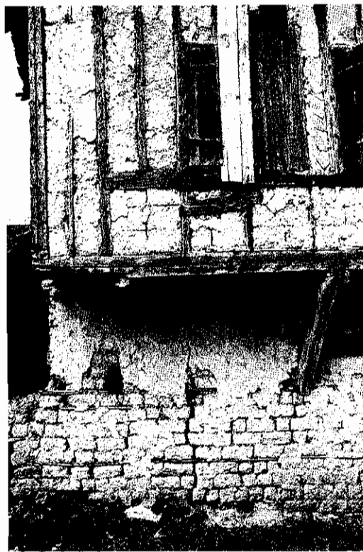
Figure 4 View of Infill-frame construction in the historic Ottoman town of Safranbolu, Turkey

example has been identified at the Minoan «New Palace» of Knossos, dated 1450BC (Kienzle, 2002). It may also be loosely related to the utilization of horizontal bands of wide and flat Roman brick that was sometimes laid at intervals into walls composed of more random mortared masonry. At Pompeii, a number of the piers between storefronts were reconstructed with brick bands, and this construction may have been part of repairs of damage from an earthquake that occurred 17 years prior to the volcanic eruption that buried the city. This same type of construction can be found in Istanbul most notably in the medieval city walls, where the belts of red brick are an integral part of the architecture —so much so that when modern restorers reconstructed a section of the walls, they applied the brick band as a thin layer on the surface, rather than as a structural layer