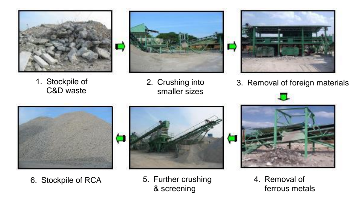
Figure 3: Processing of C&D Waste into RCA

Another unique feature of the building was the use of fibre-optic sensors embedded in the columns to monitor the long-term structural performance of the concrete. The long term monitoring data obtained from the building will be useful for in-depth structural analysis and the formulation of future specifications on the use of RCA for structural concrete. Finally, the results can be used to build confidence of industry stakeholders on the use of RCA and for policymakers to consider increasing the limit of percentage replacement of RCA for structural concrete going forward. The Samwoh Eco-Green Building has also achieved the highest green building rating, the BCA Green Mark Platinum, due to extensive use of other green and sustainable features [7].