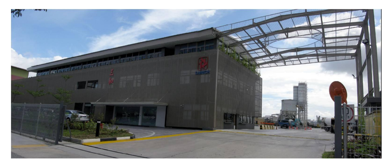
Figure 2: Samwoh Eco-Green Building

The Samwoh Eco-Green Building (Figure 2) is the first 3-storey office building in South East Asia to be constructed using concrete with RCA beyond code limits for structural concrete. It was a joint project between Samwoh Corporation, BCA and Nanyang Technological University, and funded by the MND Research Fund for the Built Environment, to conduct a full-scale evaluation on the use of various percentages of recycled concrete aggregates in structural concrete for building structures.