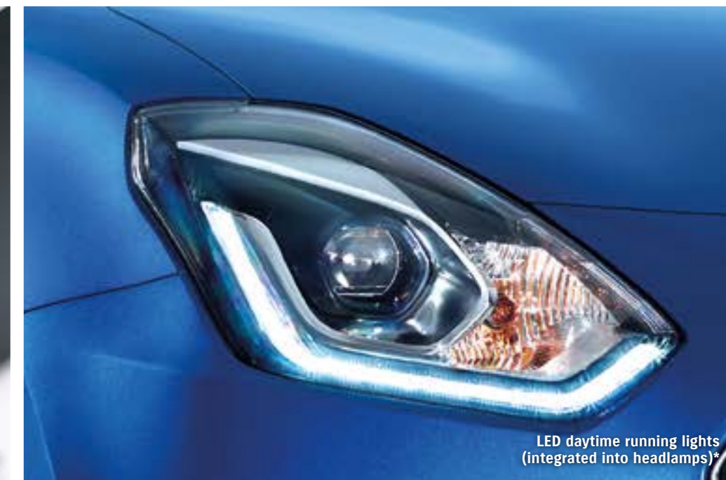
LED daytime running lights (integrated into headlamps)*