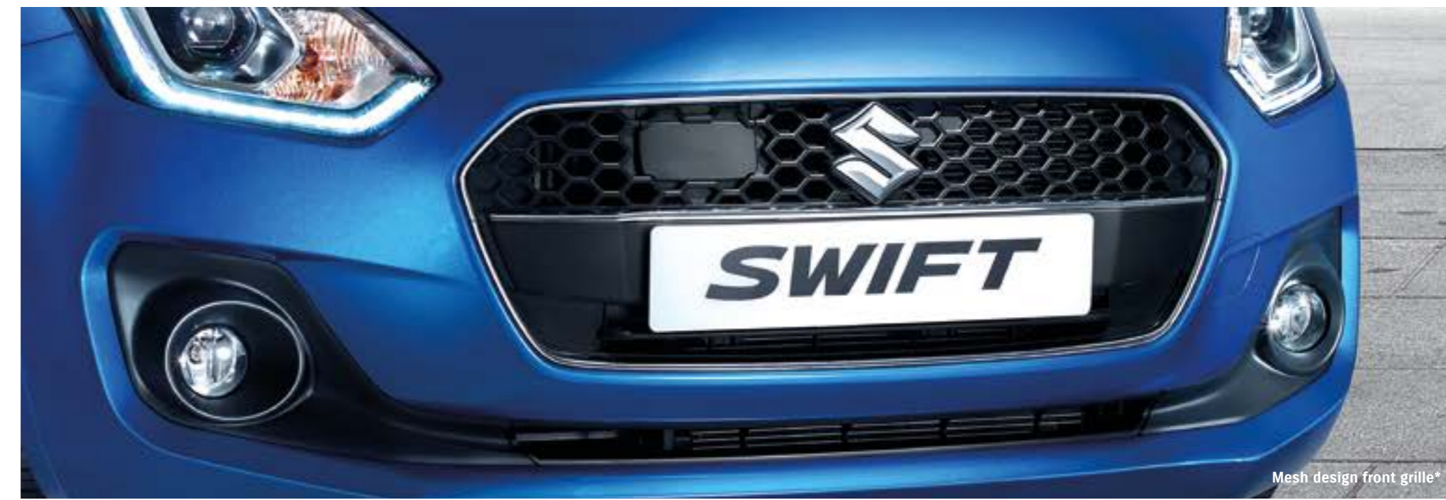
Mesh design front grille*