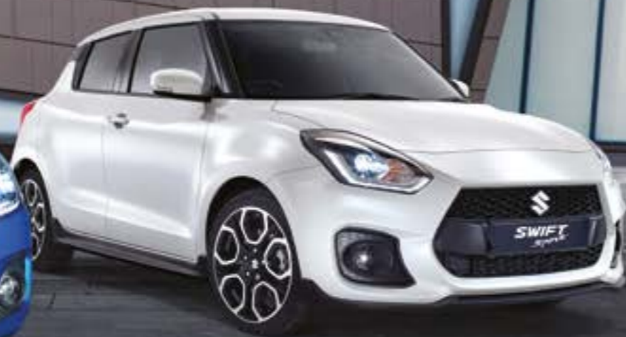
Pure White Pearl Available on all models.