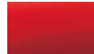
Fervent Red Available on SZ3, SZ-T and SZ5 models only.