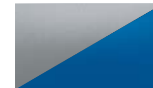
Speedy Blue Metallic with Premium Silver roof Available on SZ-T and SZ5 models only.