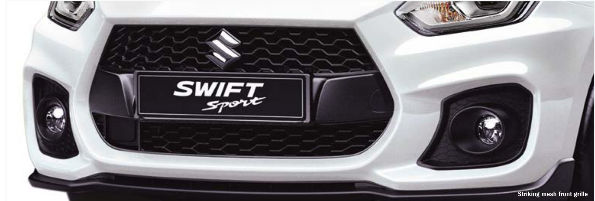
Striking mesh front grille