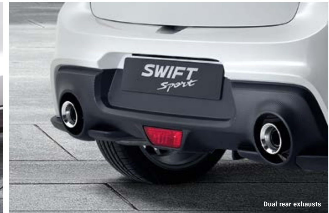
Dual rear exhausts