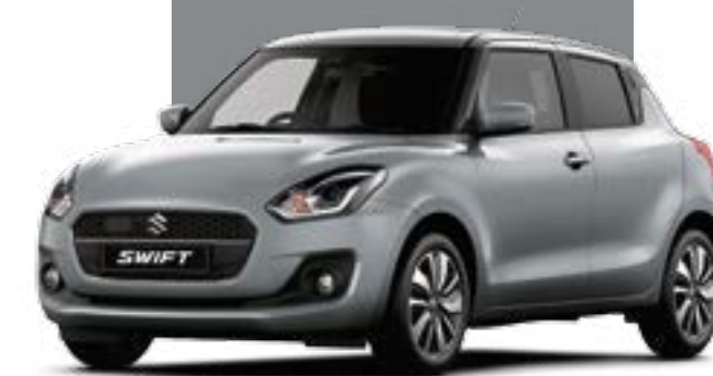
Premium Silver Metallic Available on SZ3, SZ-T and SZ5 models only.

WITH A VARIETY OF VIBRANT COLOURS TO CHOOSE FROM, THE SWIFT REALLY LETS YOU MAKE AN IMPACT.