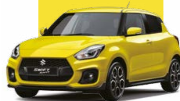
Champion Yellow Available on Swift Sport models only.