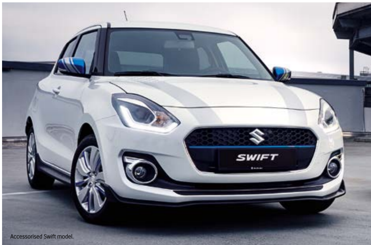
Accessorised Swift model.