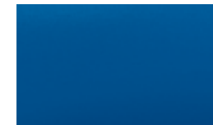
Speedy Blue Metallic Available on all models.