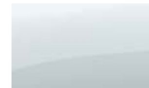
Pure White Pearl Available on all models.