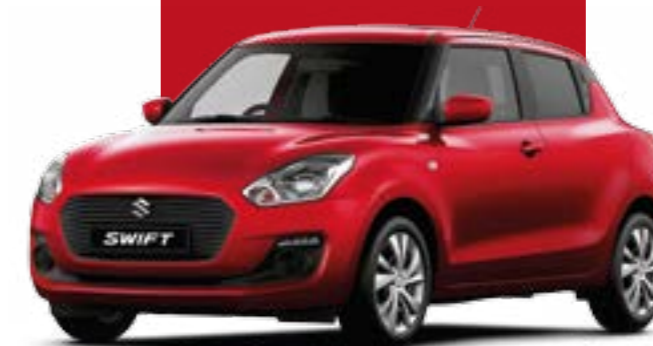
Burning Red Pearl Metallic Available on all models.