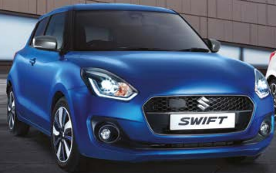
Speedy Blue Metallic Available on all models.