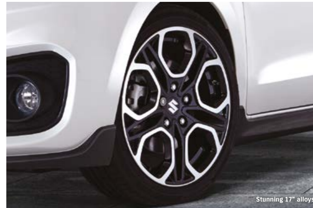
Stunning 17" alloys