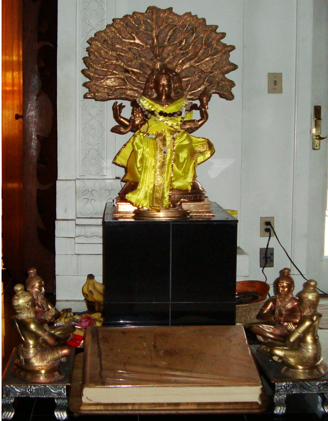
Image of Shri Dakshinamurti teaching four Rishis