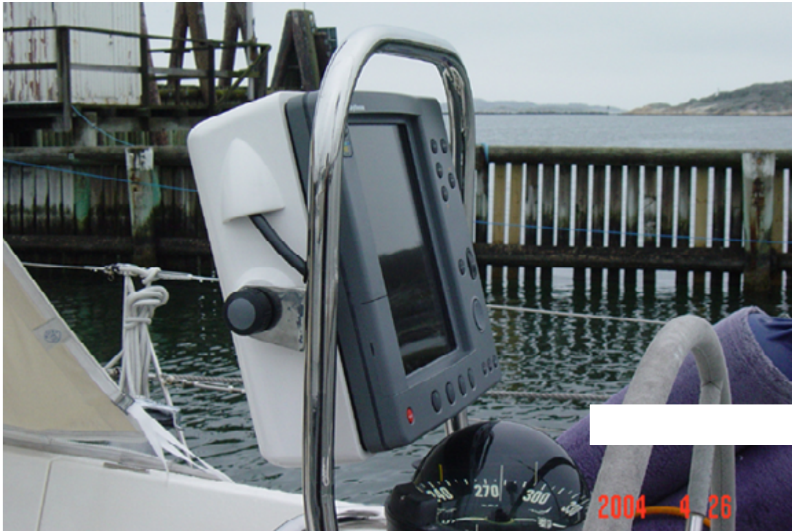
Raytheon chart and radar display with custom made box on pedestal.