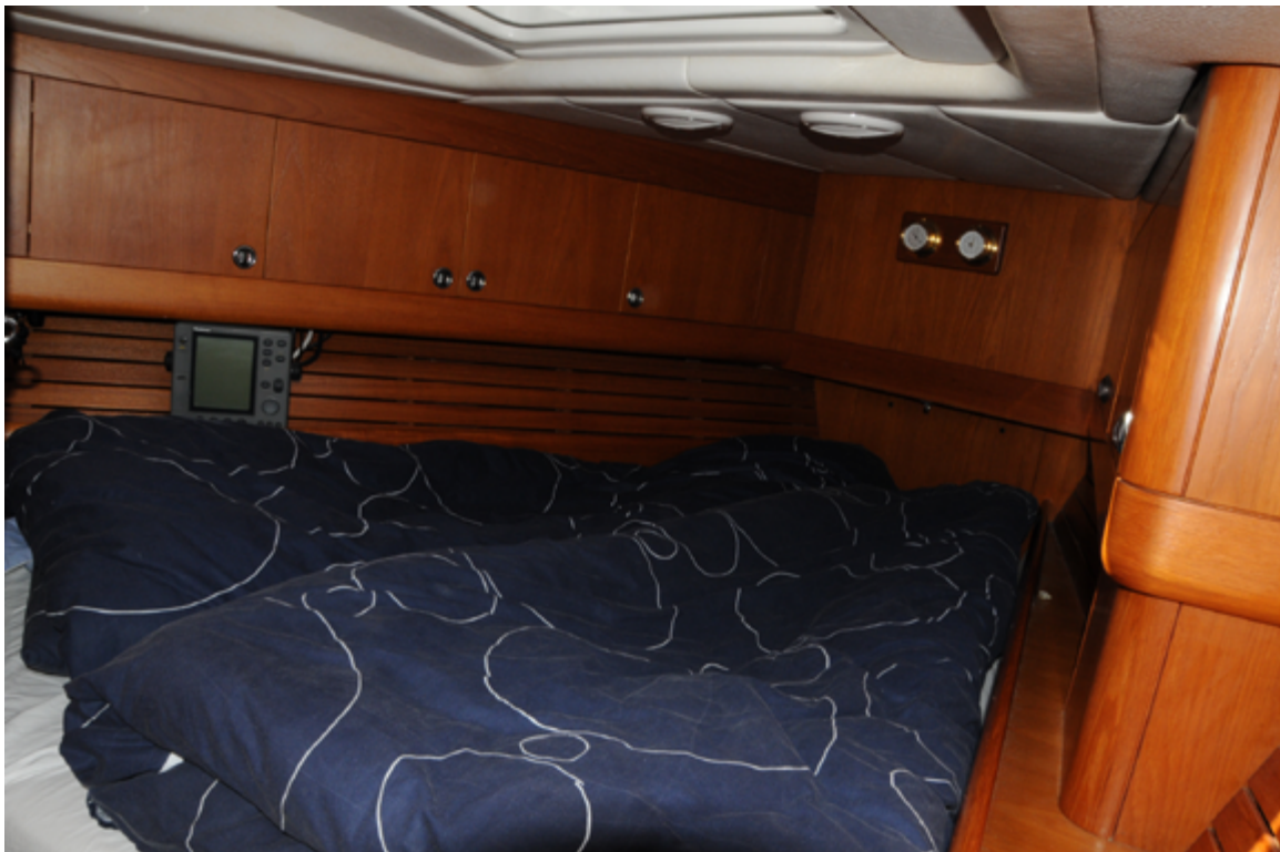
Forward cabin. Raytheon display unit for all functions including radar