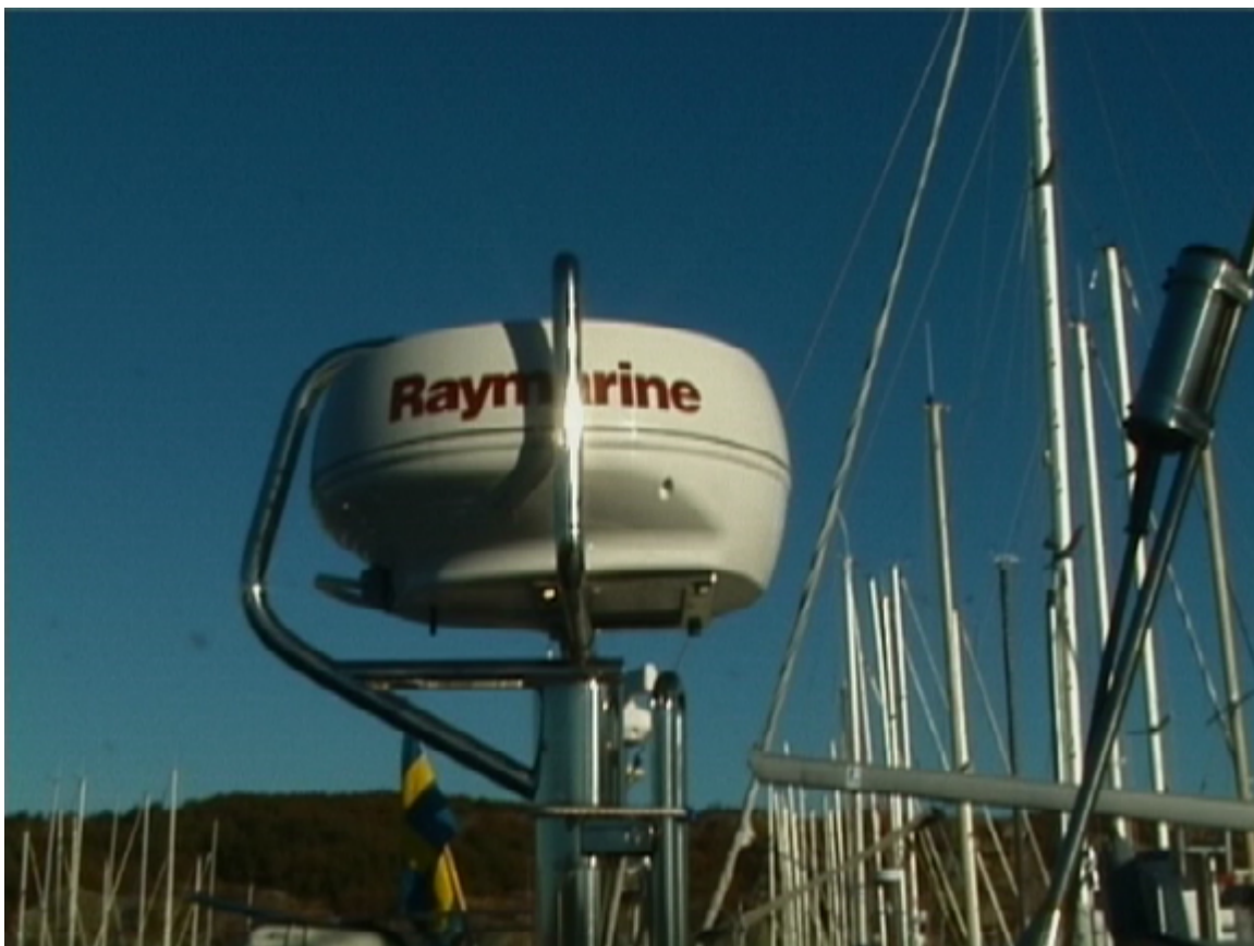
Tiltable radar on stainless pole with provision for outboard lift