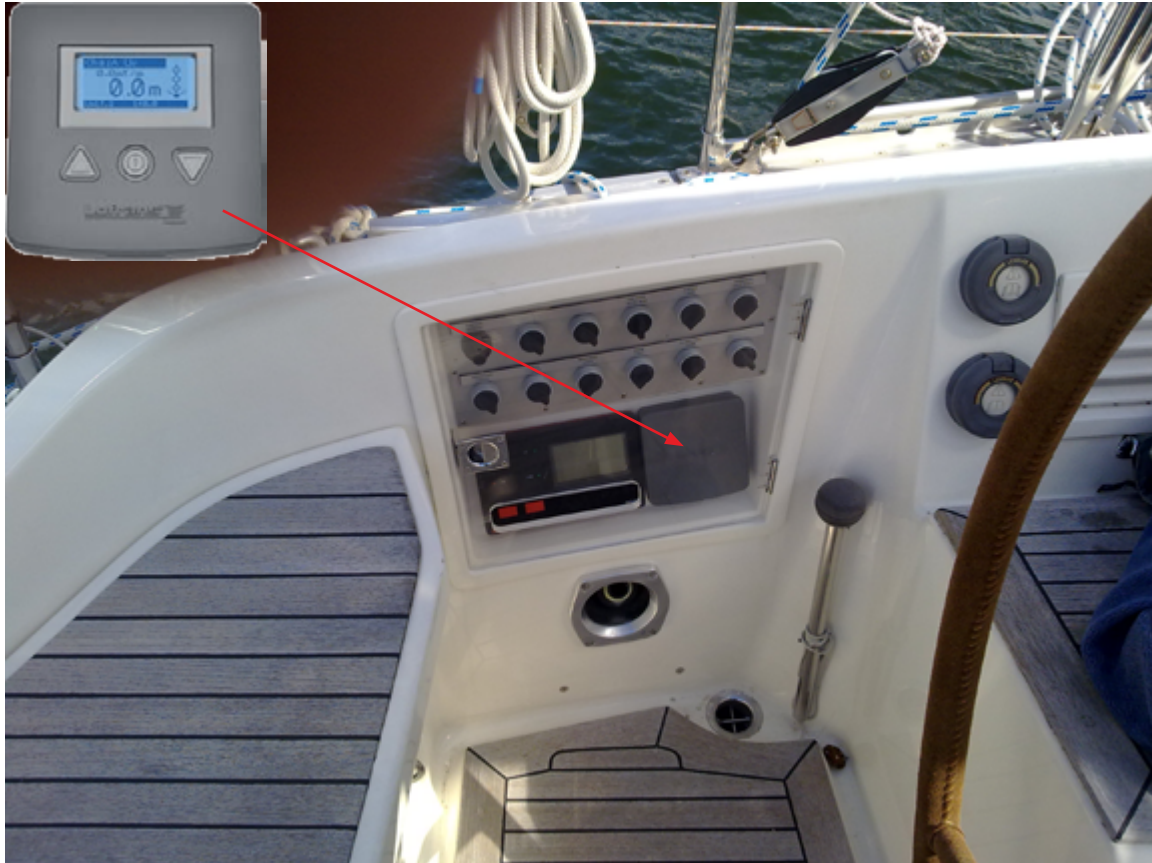
Chain counter. Windlass are located on foredeck, SB and port cockpit.