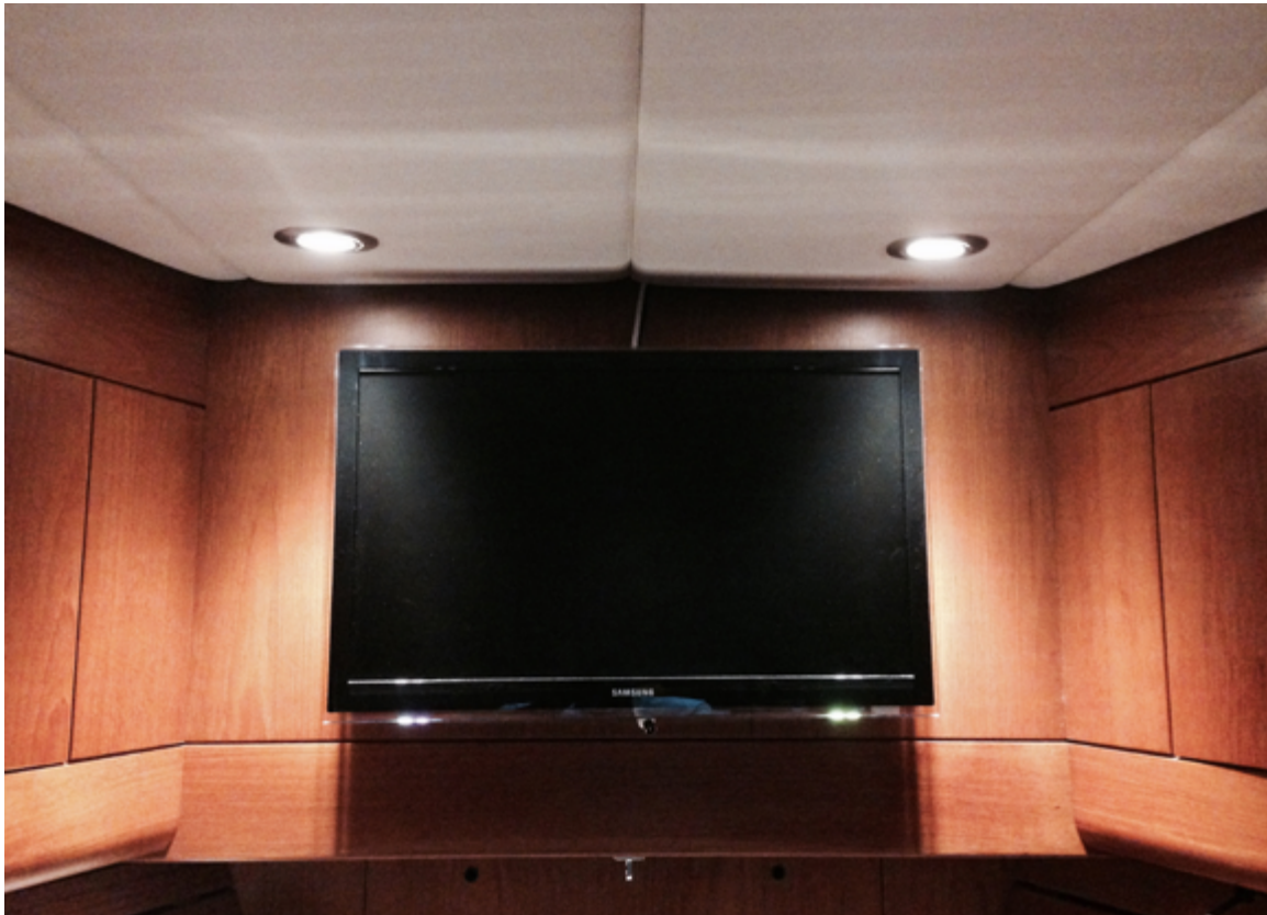
Dimmable LED-lights and Smart TV in fwd cabin