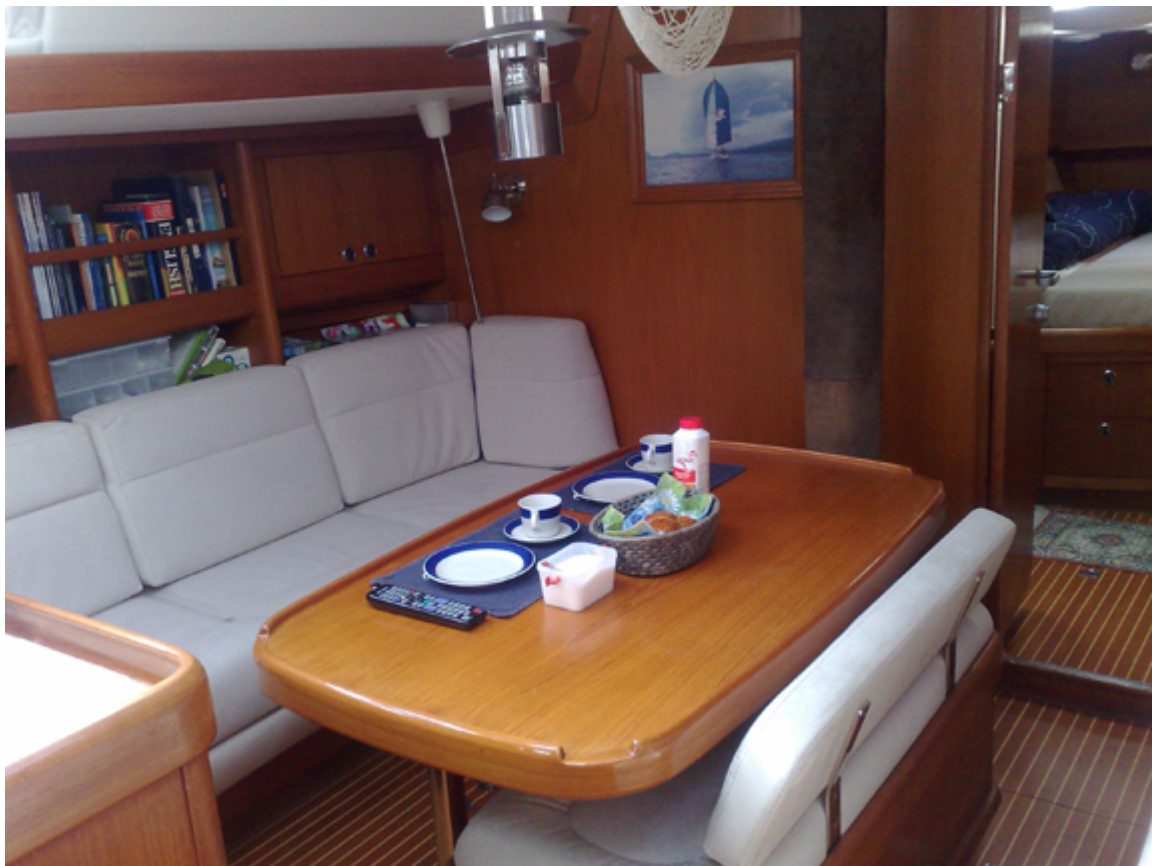
Alcantara upholstery in saloon and cabins