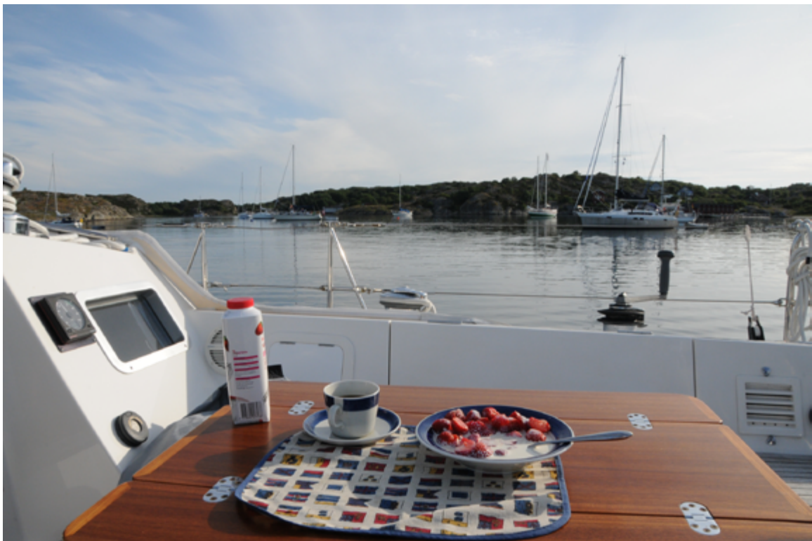
Cockpit table stows in SB locker