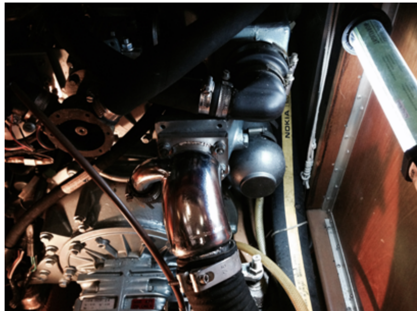
Propeller with two coats of Jotun primer and antifouling paint.