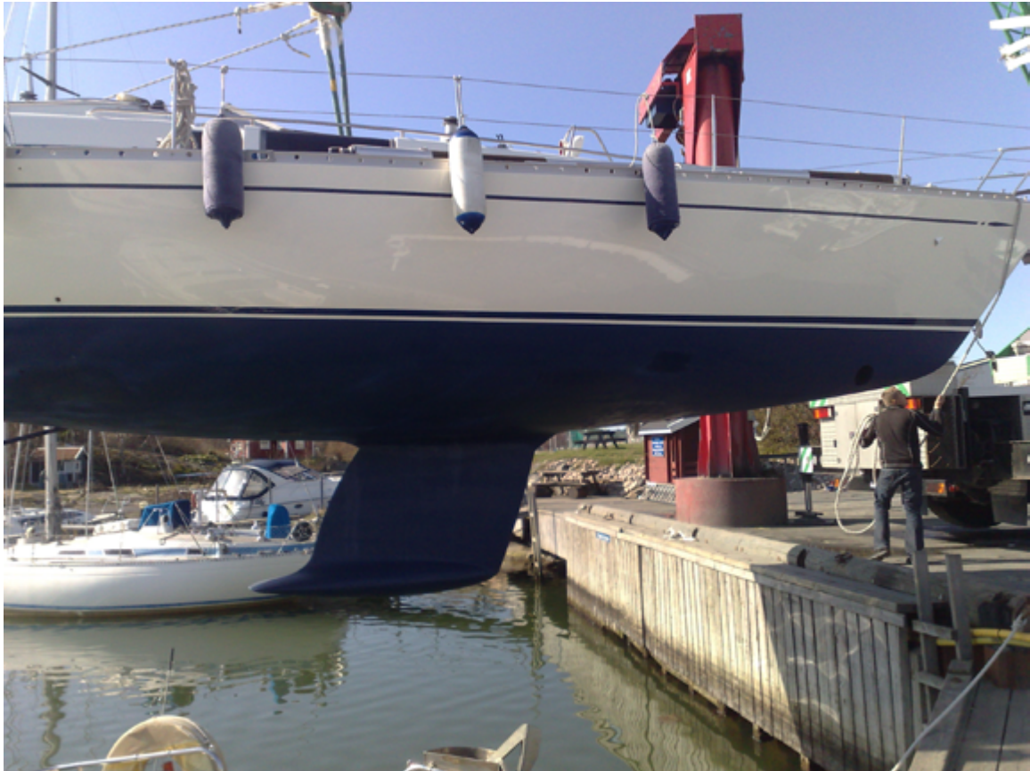
End of season