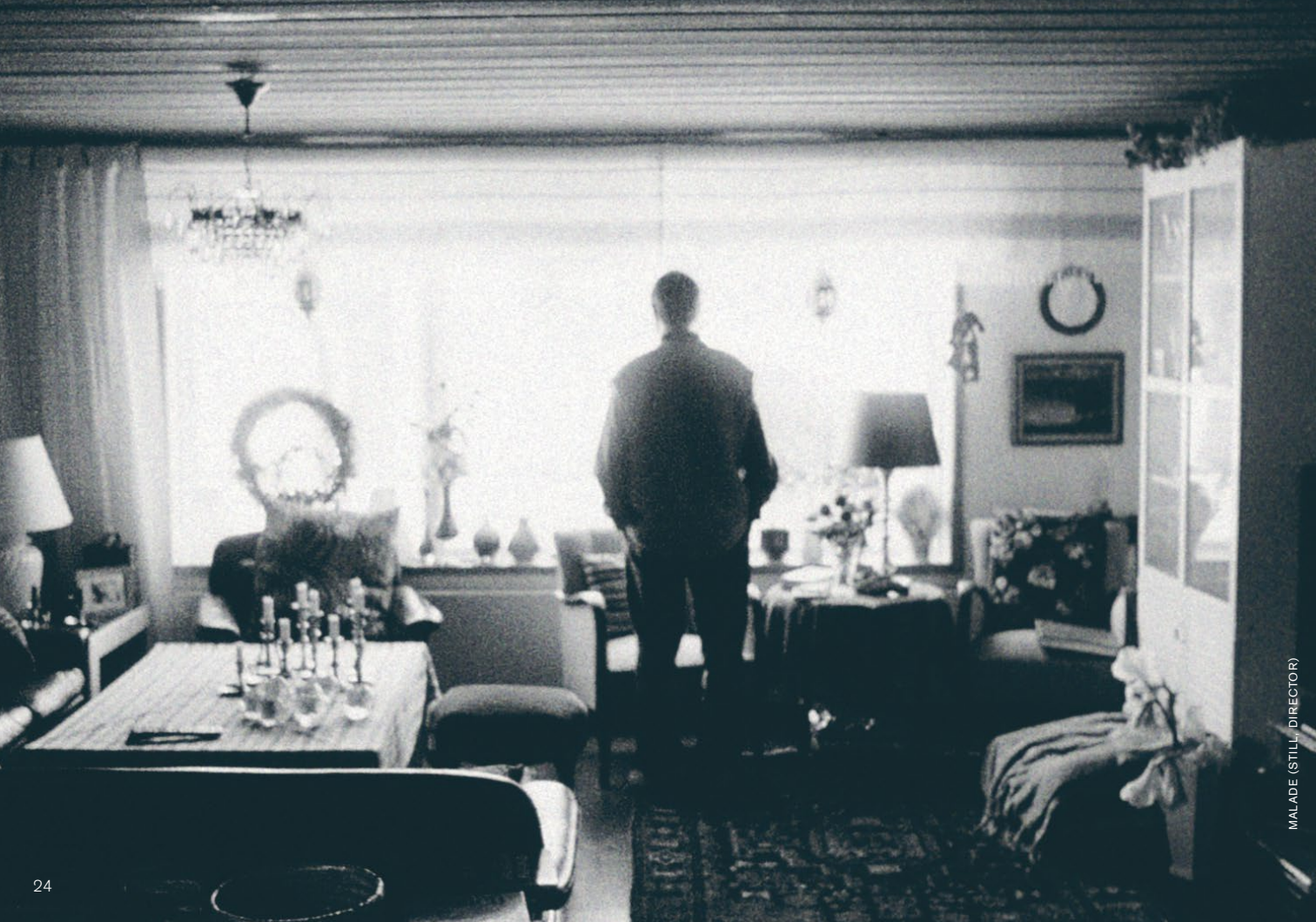
MALADE (STILL, DIRECTOR)