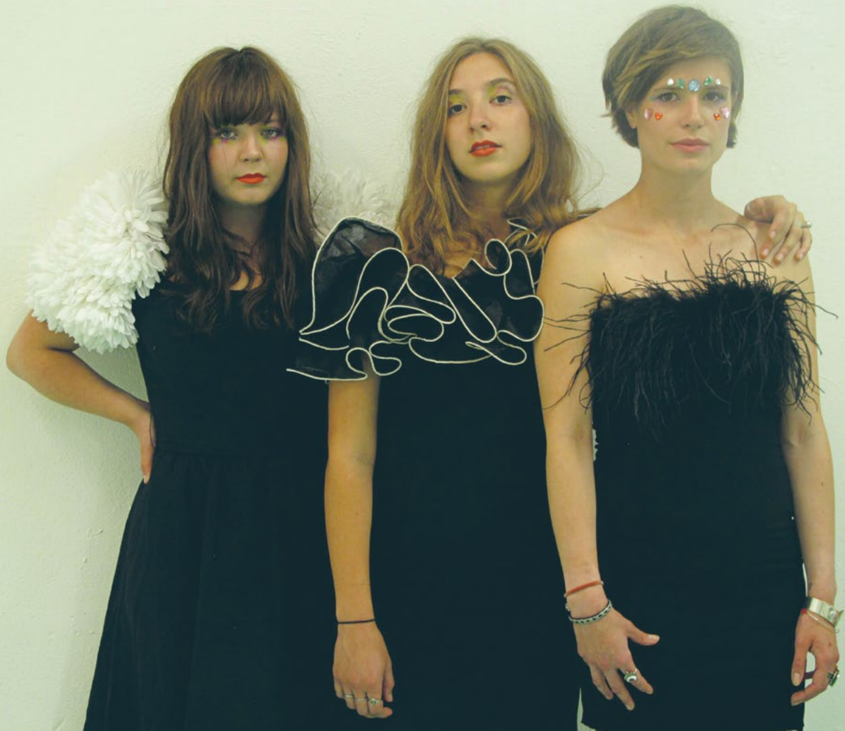
STORY (STILL), GÖRAN HUGO OLSSON (DIRECTOR)