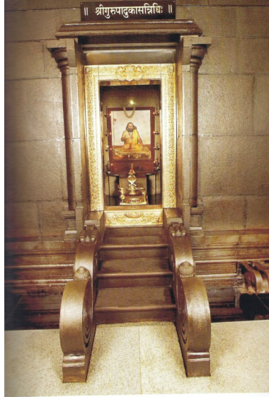
Shri Gurupaduka Sannidhih