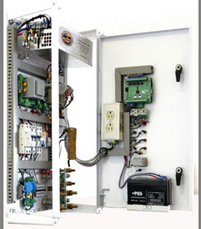
SMR SIDE VIEW WITH DOOR

Switchmode rectifiers are known for their quality, efficiency, service life and workmanship. Switchmode rectifiers have been used for many years and this demonstrates its quality service that it provides and also offers many extra features that can be installed in order to fit the specific Cathodic Protection needs. The switchmode rectifier is a newer technology and is significantly more advanced than transformer rectifiers utilizing high frequency switching devices resulting in far greater feedback responsiveness, efficiency and service life.