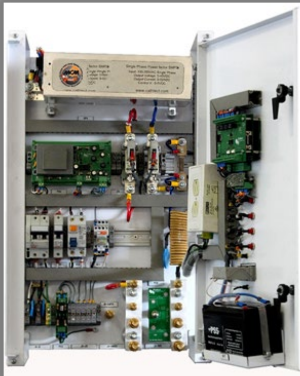
SMR FRONT VIEW WITH DOOR