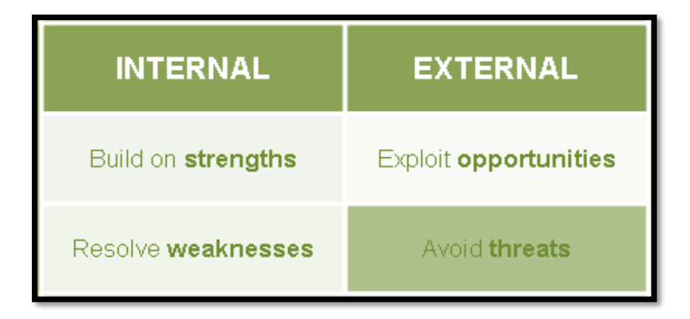
Figure (2) Strategy formulation (Author, 2018)