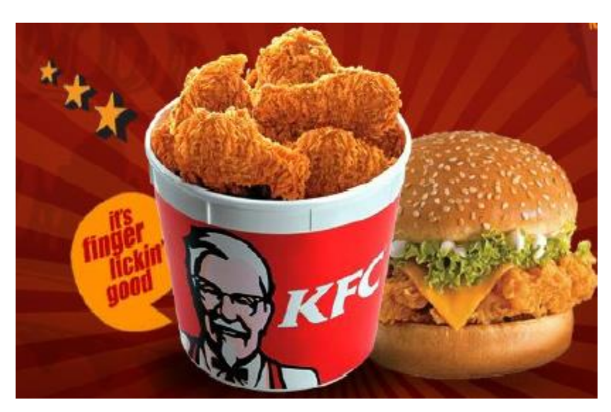
Figure (4) demonstrates KFC's products (web page)

Furthermore, the 4 p's of KFC marketing as a marketing mix are include: