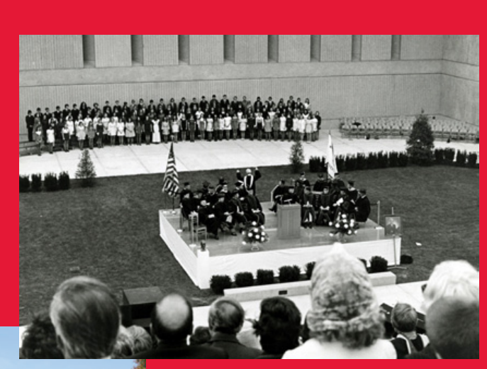
1973 dedication of the Ivan Wilson Fine Arts Center