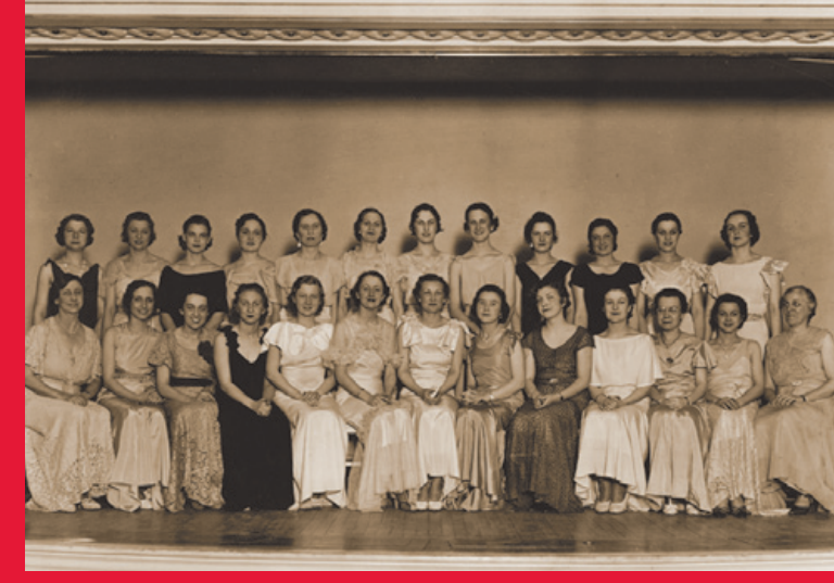
1934 Women's Glee Club