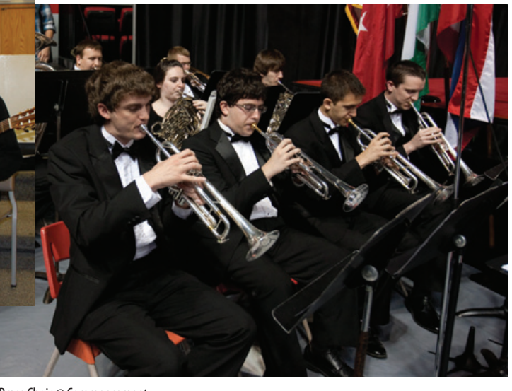
Brass Choir @ Commencement