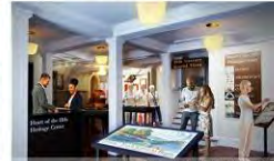
Main Entry/Lobby & Orientation