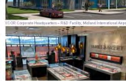
KCOR Corporate Headquarters - R&D Facility, Midland International Airport