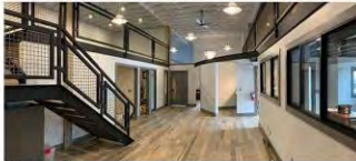
Walburn Engineering - 631 Water Street, Kerrville, TX