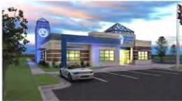
American National Bank - Lubbock, TX