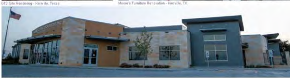
Springer Electric Corporate Headquarters - Sabalva, Texas