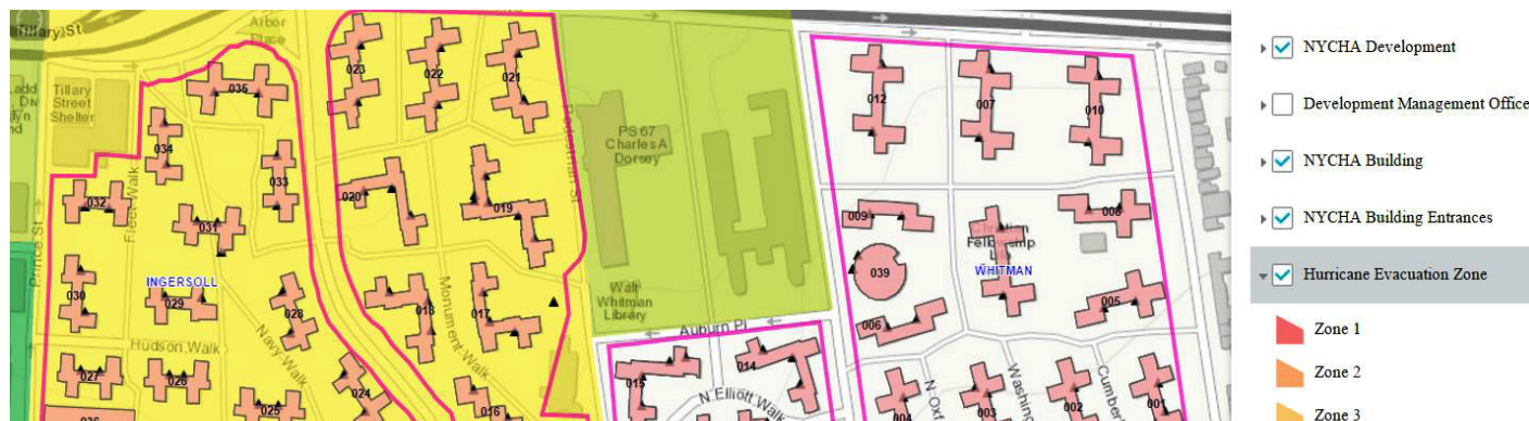
Above is an excerpt from the NYCHA Development Interactive Map and Address Search for Ingersoll and Whitman Houses. Users can search for NYCHA buildings, developments, development management offices, and boundaries for elected officials.

These customer service enhancements can enable employees to do their jobs more efficiently and just may help residents land their next job or access a training program at their local community center.