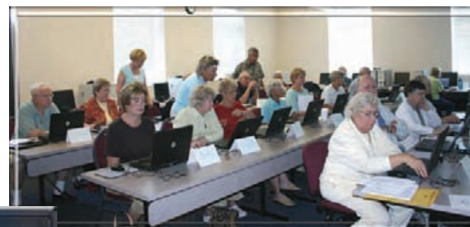
Through a grant from the Alex G. Nason Foundation, the IRSC Foundation purchased laptop computers, making popular computer offerings available to LLI participants in remote locations.

The Lifelong Learning Institute (LLI) at IRSC is redefining life after 50 for a dynamic group of active adults returning to the IRSC college classroom. A year-round calendar of affordable and accessible non-college credit programs, special events, social programs, field trips, and even travel abroad demonstrate the incredible educational resource that is IRSC.