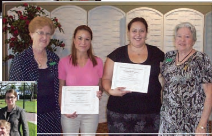
GFWC PSL Women's Club