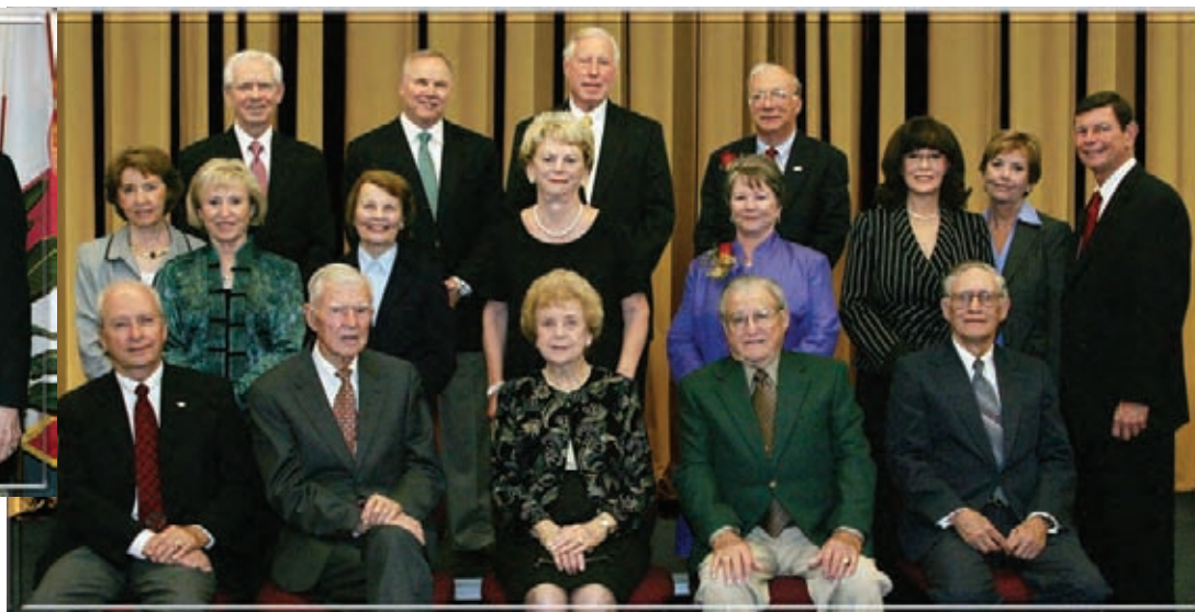
2001-2008 Entrepreneurs of the Year and their spouses