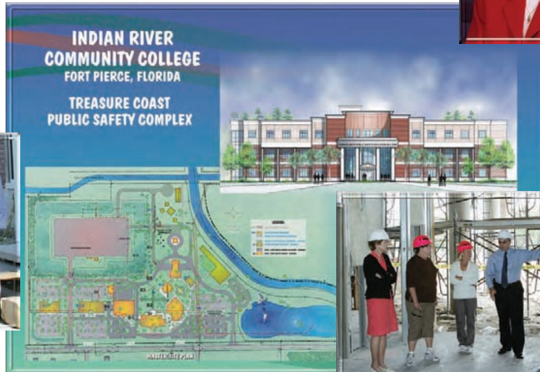
Scheduled to be completed in summer of 2009, the 50-acre, seven building, state of the art Treasure Coast Public Safety Training Complex will be a national model for criminal justice, fire science, and human services training. Only a few naming opportunities remain.