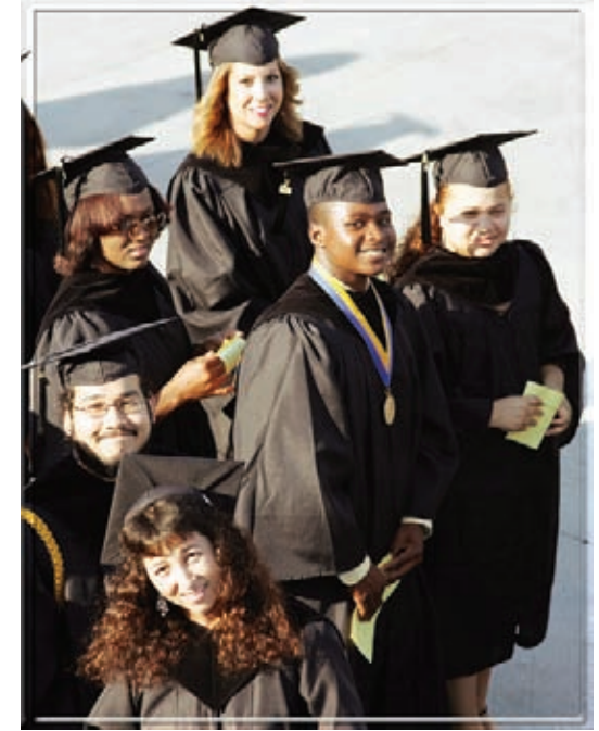
More than 3,400 deserving students were awarded scholarships through the IRSC Foundation in 2007-2008. This assistance helps students to overcome financial barriers and achieve their dreams. This, in turn, helps to improve our entire community.