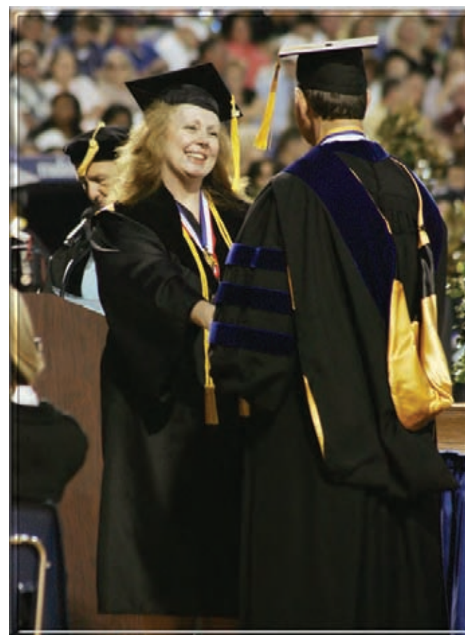
Through its Transfer Scholarship Program, the IRSC Foundation continues to assist Associate Degree graduates who are pursuing their Bachelor's Degrees. Last year, 116 students received transfer scholarships valued at $232,000.