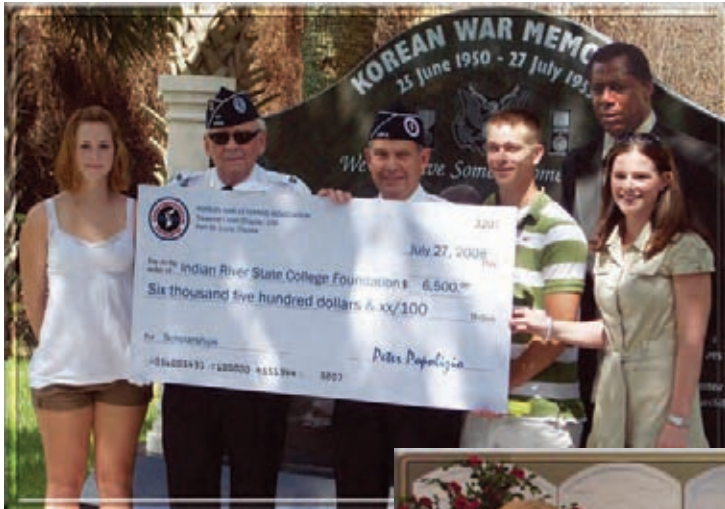
Florida Korean War Veterans Association, Chapter 106

Community organizations are outstanding supporters of scholarships through the IRSC Foundation. There is no minimum amount to establish a scholarship, which may be "customized" to match the organization's area of interest.