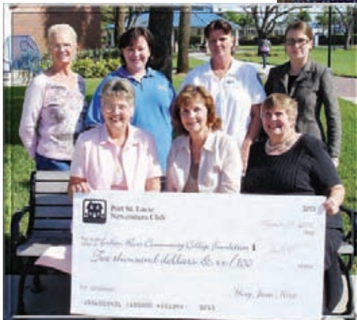
Port St. Lucie Newcomers Club