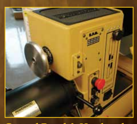
Control Panel & Headstock

Ergonomic chrome handles, finely tuned quill, and storage compartment