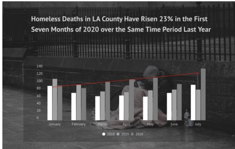
Figure 13. Goodheart, Jessica. "Homeless Deaths Are Spiking in Los Angeles and Beyond." Capital & Main - Investigating Power & Politics . Capital & Main , August 31, 2020.

require early detection of cases and contact tracing. The successes and pitfalls of Los Angeles' response to tuberculosis outbreaks among people experiencing homeless can inform current approaches to mitigate the spread and impact of the novel coronavirus.