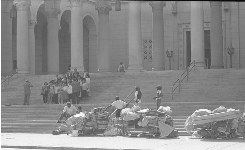
Figure 6. Homeless Men Watch as Group of People Have Picture Taken on Steps of Los Angeles City Hall, California. 1988. Photograph. Los Angeles Times Photographic Archive, UCLA Library.

County rules made it difficult to enroll in GR, as they required identification and a residence address, which many homeless people did not have. A 1982 Los Angeles Times story noted that “(o)fficials themselves contend, sometimes with a touch of pride, that the system has its own built-in Catch 22s.” 111 During the early 1980s the Republican majority on the Board of Supervisors rejected an effort to team up with the city on