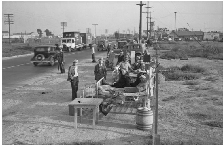
Figure 1. Officials Order Destruction of Hooverville, Los Angeles, circa 1940. n.d. Photograph.

Hoovervilles were not simply last-ditch efforts built from the edge of desperation; instead, homeless individuals set out to “construct relief shelters of [their] own.” He continued, “We were among the first to face and taste the bitter realities of a social system that would not provide employment for willing workers to enable them to care for themselves,