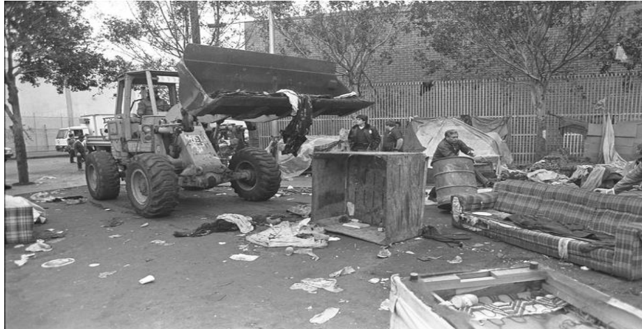
Figure 10. Bulldozer Clearing Homeless Camp in Los Angeles, California. 1987. Photograph. Los Angeles Times Photographic Archive, UCLA Library.

ordinances concerning sidewalk use. Activists urged Mayor Bradley to halt the sweeps, but he declined. Reflecting on this episode a few months later, he said, “I thought it was necessary...There was a condition of filth and obstruction on the sidewalks...that nobody would tolerate in their neighborhood, the rodent infestation, and the human excrement