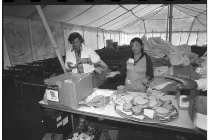
Figure 5. Volunteers Making Sandwiches for Occupants of Tent City II, in Los Angeles, California. 1986. Photograph.

The effects of rising housing costs in the 1970s were felt most acutely in neighborhoods beset by decades of overcrowding, which, again, largely fell along racial lines. Census data show that in Compton, Florence-Graham, East Los Angeles, and other Black and Latinx communities, the portion of nonrelatives per household doubled between 1970 and 1980, only to double again over the next decade. 69