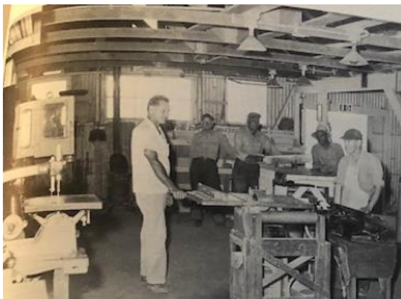
Figure 2. Los Angeles County Department of Charities Annual Report, Fiscal Year 1956-1957, Box 23, Folder 6, Los Angeles County Department of Public Social Services records, Collection no. 0431, California Social Welfare Archives, Special Collections, USC Libraries, University of Southern California.

During the postwar period, public and private welfare providers tended to view homelessness not as a symptom of an uneven labor market or a sign of unmet demand for government-subsidized housing, but as a problem of disability, employment history, and individual pathology. 56 In the 1950s, most private shelters and indigent services were clustered around the city's downtown. Once known as a way station for seasonal workers and individuals and families migrating to the city, the Skid Row area was transforming into a community associated with unemployed or underemployed older white men, many of whom suffered from alcohol dependence and physical and mental disabilities. 57 While African Americans certainly bore a disproportionate share of poverty and unemployment, at the time in the center of the city, the site of most public and private homeless services, the low-income population remained visibly older and whiter. Therefore, unemployed or underemployed older white men unmoored from the