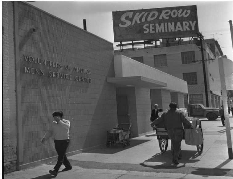
Figure 3. Men Walking by Entrance to Los Angeles' Skid Row Volunteers of America Men's Service Center. 1964. Photograph.

The county's commitment to providing shelter fifty miles from downtown may have reflected the desires of some homeless individuals for accommodations outside a dilapidated and overcrowded urban core. 60 But as in the Depression-era, the context of choice was shaped by severe deprivation as well as by the central city's prevalence of