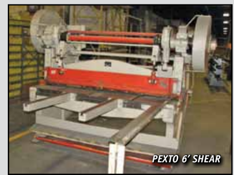
PEXTO 6' SHEAR