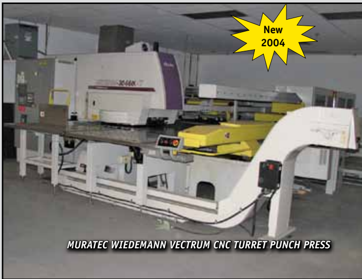
MURATEC WIEDEMANN VECTRUM CNC TURRET PUNCH PRESS

10% BUYERS PREMIUM APPLIES ON ALL ONSITE PURCHASES 13% BUYERS PREMIUM APPLIES ON ALL INTERNET BIDDERS