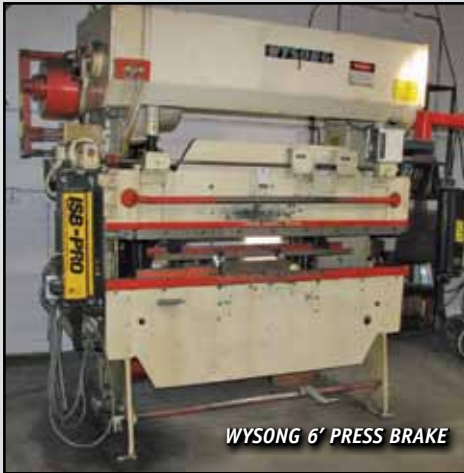
WYSONG 6' PRESS BRAKE