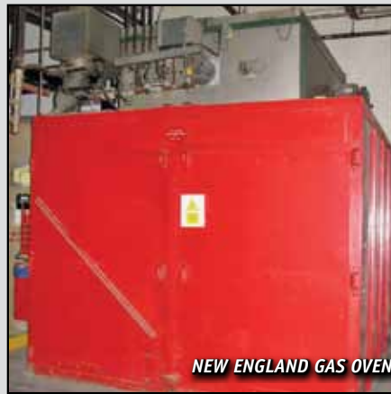
NEW ENGLAND GAS OVEN