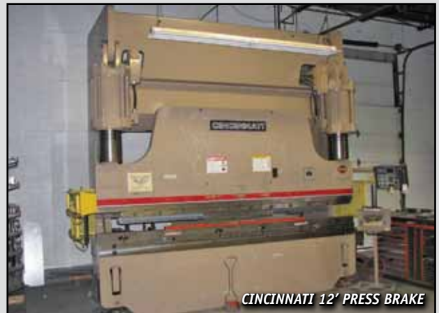
CINCINNATI 12' PRESS BRAKE