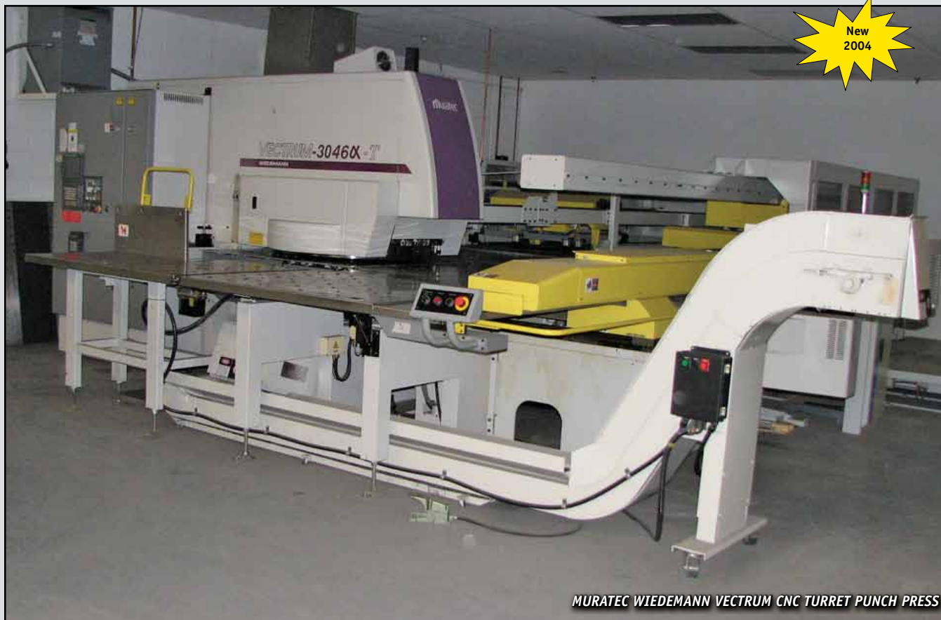
MURATEC WIEDEMANN VECTRUM CNC TURRET PUNCH PRESS

INSPECTIONS: WEDNESDAY, MARCH 23 RD – 10:00 A.M. TO 4:00 P.M. & MORNING OF SALE – 8:30 A.M TO 10:30 A.M.