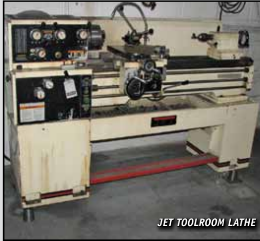
JET TOOLROOM LATHE