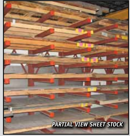
PARTIAL VIEW SHEET STOCK