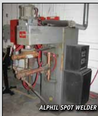
ALPHIL SPOT WELDER