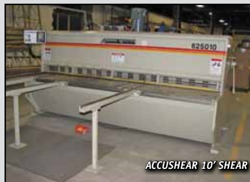
ACCUSHEAR 10' SHEAR