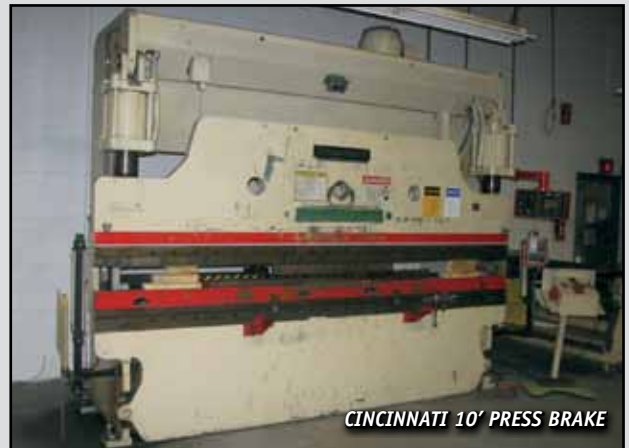
CINCINNATI 10' PRESS BRAKE