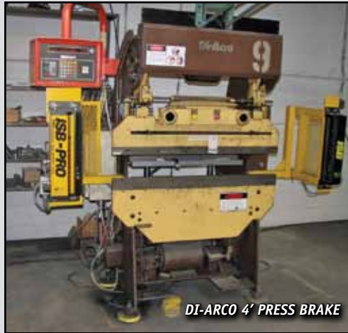
DI-ARCO 4' PRESS BRAKE