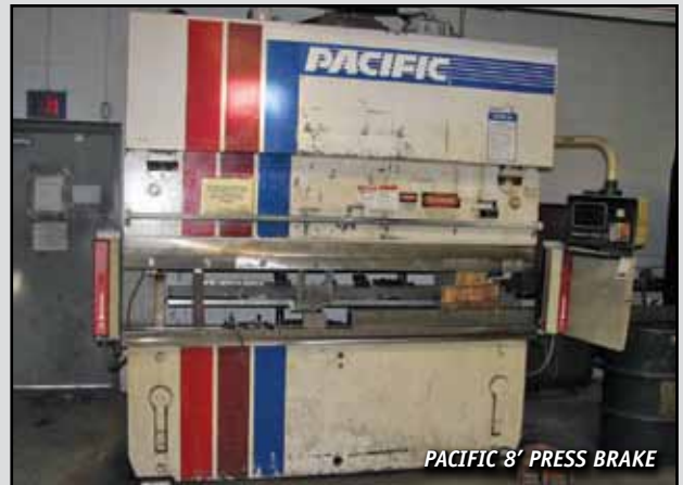
PACIFIC 8' PRESS BRAKE