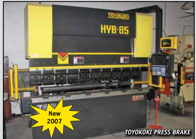
TOYOKOKI PRESS BRAKE

THE INFORMATION DESCRIBED IN THIS BROCHURE IS CORRECT TO THE BEST OF OUR KNOWLEDGE BUT WE CANNOT GUARANTEE SAME. IT IS FOR THIS REASON THAT BUYERS SHOULD AVAIL THEMSELVES OF THE OPPORTUNITY FOR INSPECTION PRIOR TO THE SALE.