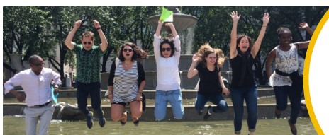
7:00PM SOCIAL EVENT: SCAVENGER HUNT!

Learning Objectives: (1) Participants will be able to describe intergenerational trauma. (2) Participants will be able to identify the impact of intergenerational trauma on children and families. (3) Participants will be able to describe strategies to improve the well-being of those affected by intergenerational trauma.