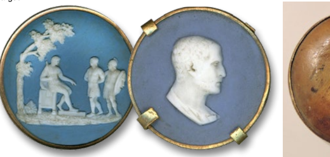
Two 18th C woodbacks with metal rims