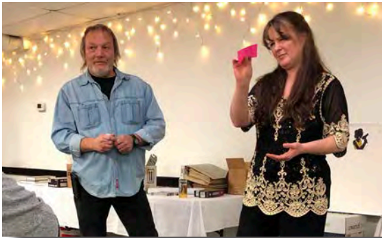
Tomahawk Chapter Annual Banquet