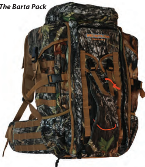
The Barta Pack

Along with primitive bow building we see an overall shift to getting back in touch with earth skills or primitive skills as