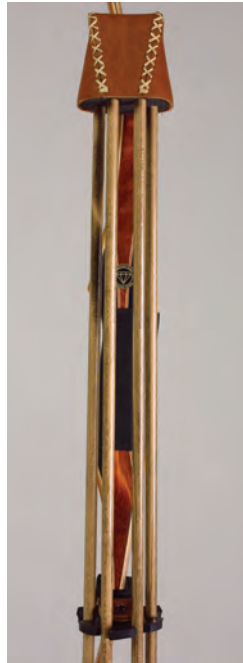
At left, the compact Cherokee bow quiver from Eagle's Flight Archery.

The Venom is a stretched version of Martin's Bamboo Viper introduced in '07. The Venom's 66 inch length is ideal for this style of reflex/deflex longbow and long-draw shooters will appreciate its smoothness and