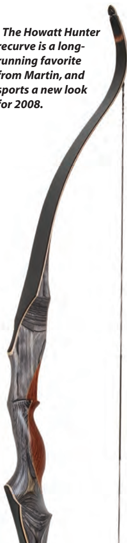
The Howatt Hunter recurve is a long-running favorite from Martin, and sports a new look for 2008.