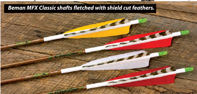
Beman MFX Classic shafts fletched with shield cut feathers.