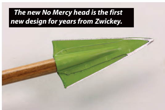
The new No Mercy head is the first new design for years from Zwickey.

mentioned that the modern side of traditional archery is growing, and interestingly enough, the other segment with the most noticeable increase is the primitive side. To meet the growing demand we've more than doubled our all-wood bow and bow kit selection. From pre-planned bamboo, to pre-glued bow blanks, to English style longbows complete with horn nocks, it seems like we're adding items daily. To help with building these bows or completing the kits we've added several new bow building rasps and other bow building tools as well as new books, booklets, and DVD's. Bow building is big business in traditional archery circles. It seems everyone wants to make his or her own bow. With these new kits and a few strategic tools you don't have to stock too much to take care of a lot of folks. Who knows? You might want to build your own bow too.