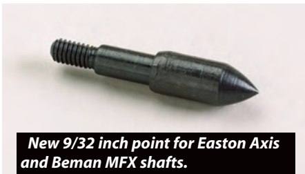
New 9/32 inch point for Easton Axis and Beman MFX shafts.

That will get you started for a big year in traditional archery. Trends are always changing and there are