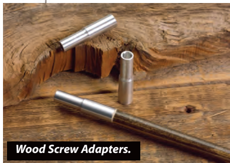
Wood Screw Adapters.