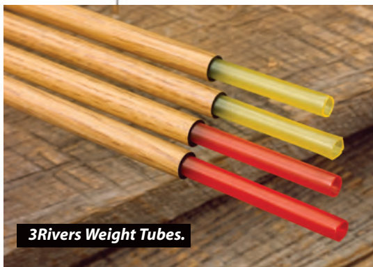
3Rivers Weight Tubes.