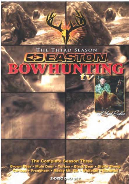
The third season of Easton Bowhunting has been released on a 2-DVD set designed to retail for under $20.

a big draw and this year is no exception. There are many new titles and they're selling strong. Modern Traditional from Dead-On Traditional and Ty Pelfrie covers in detail shooting techniques and bow set-up for FITA style outdoor shooting. A fairly straightforward string-walking system is described along with bow set-up and tuning tips for serious field archery recurve shooting. The guys at Traditional Vision Quest have released their Masters of the Barebow Volume 2 and it's the perfect follow-up to their first volume. Packed with one-on-one shooting tips from various top shooters, they cover everything from shooting self bows, to a fluid Howard Hill style, to face-walking, string-walking, gap at bow and many others. Two hours of intense how-to instruction from the best in the business. Both volumes of Masters of the Barebow will be strong sellers in 2008.