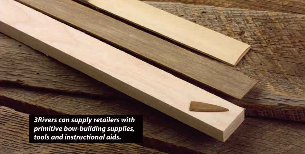
3Rivers can supply retailers with primitive bow-building supplies, tools and instructional aids.

always a myriad of new products every year. We hope we've been able to shed some light on which items are our top picks for best sellers in 2008. Have a great year and we'll see you in the field.