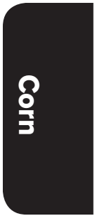
Table 6. Weed Response to Postemergence Herbicides in Corn—Broadleaf Weeds