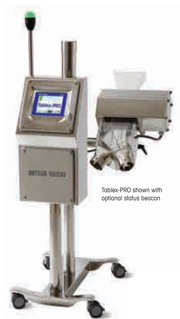
Tablex-PRO shown with optional status beacon