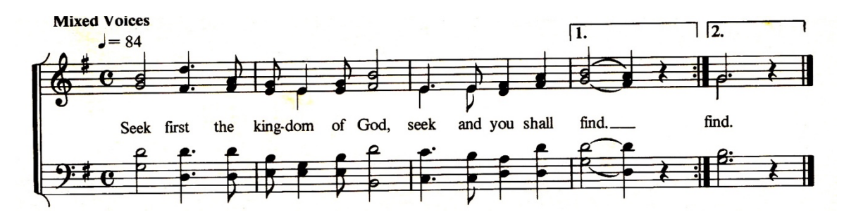
CHANT 1: Seek first the Kingdom of God

SCRIPTURE: Genesis 2:18 read by Heather Whiting