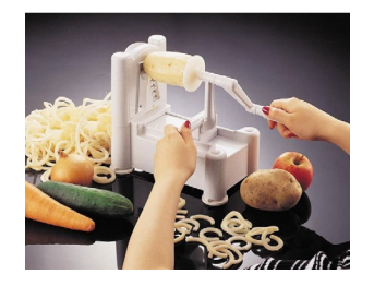
Pictured Above: Countertop Spiralizer