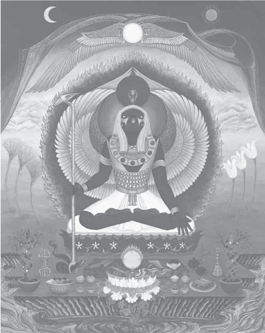
All-Beneficent Ra-Hoor-Khuit by Kat Lunoe see explanation page x