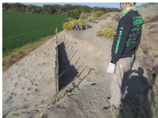
Dan surveys the problem