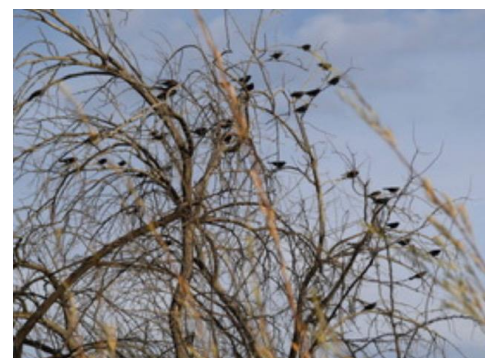
Red-winged Blackbirds By Tanya Lasuk