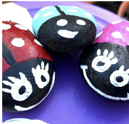
Painting ladybug rocks