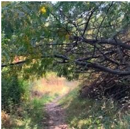
This was a tangled mess