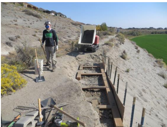
The first three layers of the retaining wall installed