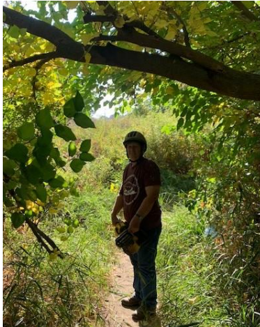
Contemplating the best way to cut