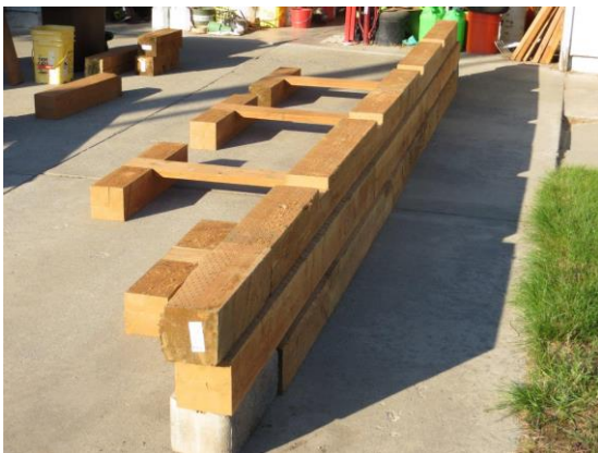
The first three layers of the retaining wall assembled in my driveway

A couple years ago an erosion problem started in a spot of the Tapteal Trail along the Horn Rapids neighborhood. Over time the problem grew to about a twenty foot stretch of the trail. After building six timber retaining walls along the Grayhawk section of the trail, we finally felt confident to repair this section. In addition to dealing with a steep hillside, the project site was located more than a third of a mile from the nearest access point and the final section of trail consisted of deep loose sand. We couldn't have taken on this project without the loan of the concrete buggy from Friends of Badger Mountain along with Jim Langdon's pickup (well actually we could have done it, but the equipment rental and delivery fees would have sunk our budget). In the process of shoveling up rock from a previous pile three of the volunteers suffered a total of eight yellowjacket stings (they had a nest under the pile and were they ever pissed at us). Other than that the project went smoothly. We started on a Tuesday and finished the following Monday (the preceding week I prepared the timbers in my driveway, and boy, those pressure treated timbers are heavy). The repair required four layers of timbers and over six yards of fill material. Funding for this project, along with the previous purchase of the concrete buggy, was provided by grants from REI. Thanks to volunteers Stan, Dan and Kip as well as the scouts from Troop 190 and Troop 219.