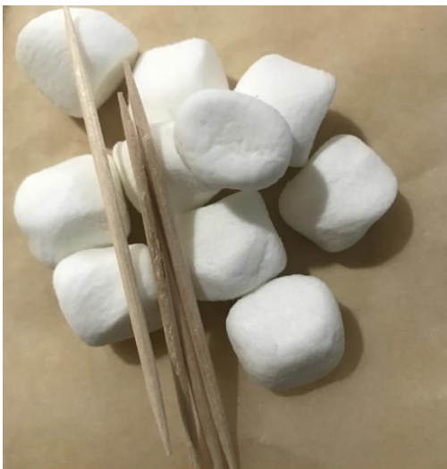
Marshmallow and toothpick Constellations – Perseus for the Perseids meteor shower

Currently our focus is on wetlands and its food web. We look forward to seeing you at #TaptealTuesday.