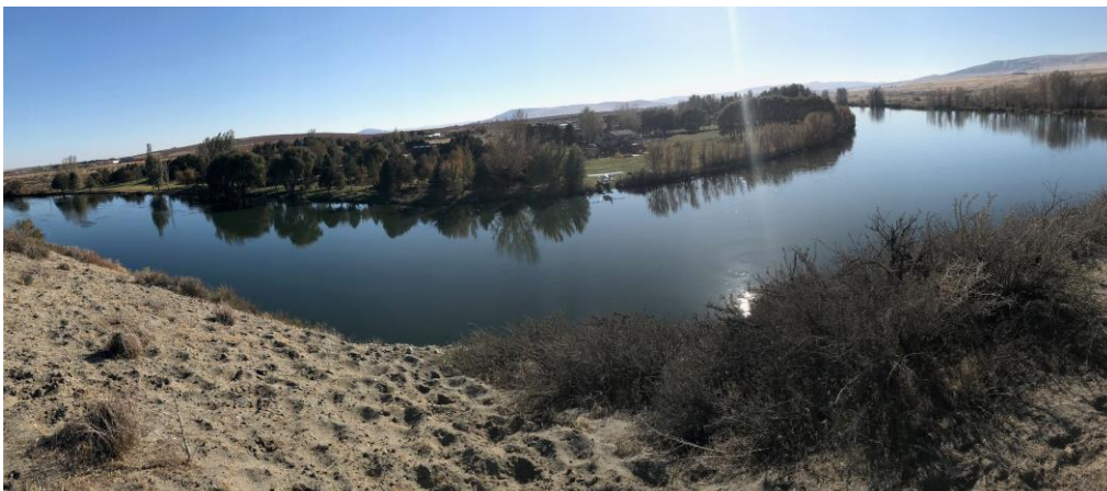
Taken from the Bench at the Overlook

So if you like low to no trail traffic and development, a constant view of the beautiful Yakima River, and an amazing variety of plants, this is a great hike for you.