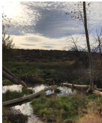
Beaver Activity By Wyatt McKellep