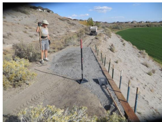
Stan surveys the completed project