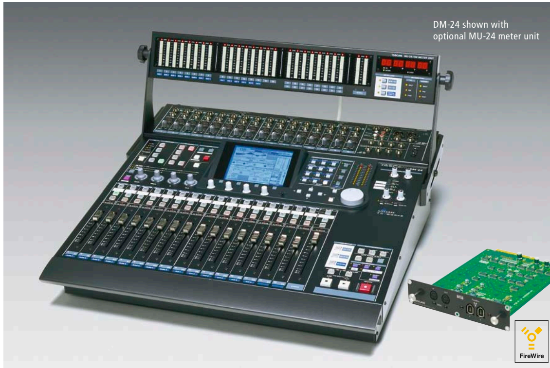
DM-24 shown with optional MU-24 meter unit